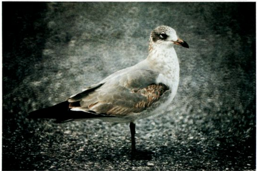
This gull at Ocean City, Maryland, on February 10, 1991, showed a combination of characteristics that suggested it was a hybrid Ring-billed X Laughing Gull in first-winter plumage.