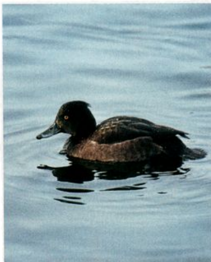
Female Tufted Duck at St. John's, Newfoundland, January 8, 1991.