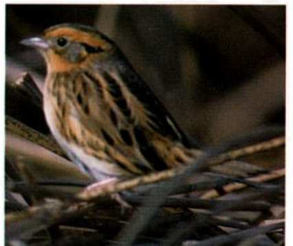
Le Conte's Sparrow at Fort Lyon, Colorado, December 1990. Four individuals spent the winter in a marsh here, providing only the second firm record for Colorado.