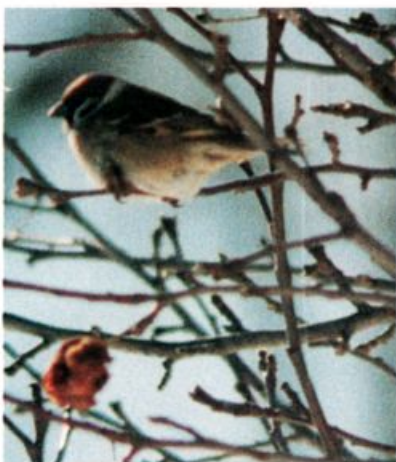
Eurasian Tree Sparrow in Pierce County, Wisconsin, February 24, 1991. Apparently the introduced population in the St. Louis area is continuing to very slowly expand its range.