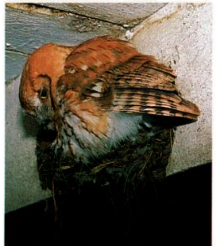
A new species of barn owl? This rufous morph Eastern Screech-Owl roosted atop a Barn Swallow nest in a barn near Kleefeld, Manitoba, in February 1991.