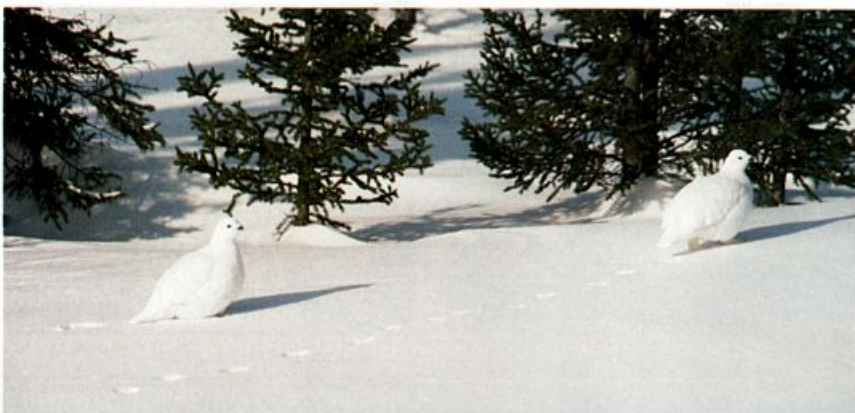
Willow Ptarmigan on the James Bay Road, Quebec. The species staged a major invasion in eastern Quebec during winter 1990-1991.