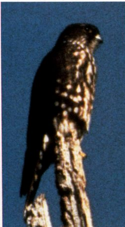
Merlin near Bishop, Inyo County, January 26, 1991. This bird shows the blackish coloration typical of the race suckleyi, a rare visitor to southern California.