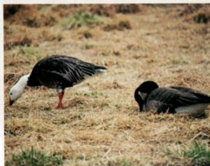
Blue morph Snow Goose in Unicoi County, Tennessee, January 29, 1991. First local winter record.