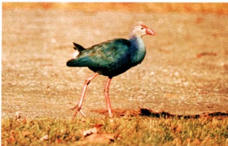
Members of the rail and gallinule family are famous for their long-distance wanderings. Even so, this Eurasian Purple Gallinule in Delaware in December 1990 was widely (but not universally) considered most unlikely as a genuine wild stray.