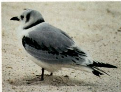
Black-legged Kittiwake in first basic (first-winter) plumage in Bay County, Florida, January 3, 1991. Apparently a first county record.