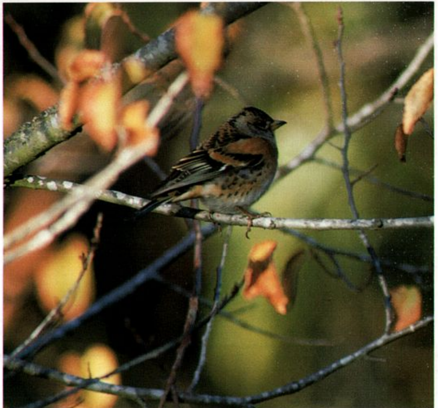
Fall through winter 1990-1991 turned out to be an exceptional season for Bramblings in northwestern North America. Among the farthest afield of the birds from this "invasion" was this Brambling at Santa Cruz, California, December 30, 1990.