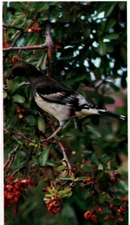
Male Aztec Thrush feasting on pyracantha berries at Portal, Arizona, January 27, 1991. First winter record for Arizona of this stray from Mexico.