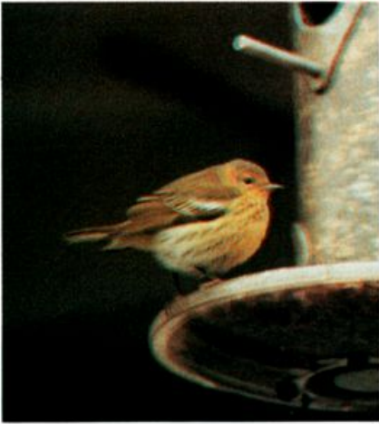
Cape May Warbler exploiting a most unusual food source for the species, a seed feeder, in Plainfield, Illinois, December 17, 1990.