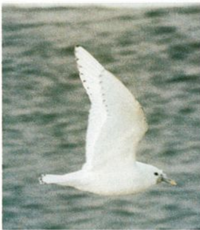
Immature Ivory Gull at Red Rock Reservoir, Iowa, December 30, 1990. The first state record, and the high point of the winter for many midwestern birders.