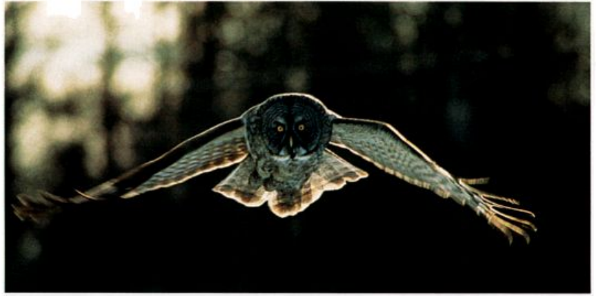
In a winter that was notable for several owl species, southeastern Manitoba had near-record numbers of Great Gray Owls, with perhaps more than 300 present. This one was just across the border in Roseau Bog, Minnesota, February 2, 1991.