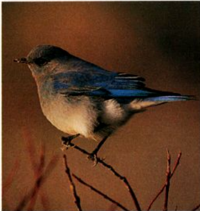
Mountain Bluebird at Hillman Marsh, Essex County, Ontario, December 12, 1990. Probably a first-winter male, as suggested by the contrastingly dull and pale outermost greater coverts in the wing.