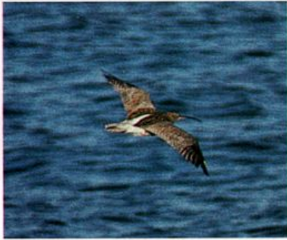
This Eurasian Curlew at Ferryland, Newfoundland, on January 7, 1991, furnished one of the few North American records, but it disappeared shortly after its discovery when extreme winter weather set in.