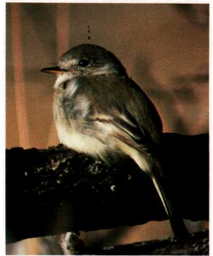
Gray Flycatcher in Karnes County, Texas, December 7, 1990. This bird, which provided the first winter record for Texas, spent the entire winter at this location.