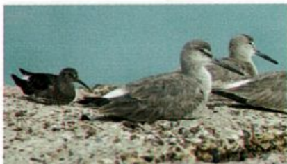
Purple Sandpiper (with Willets) at Boca Chica jetty, Cameron County, Texas, February 28, 1991. One of the southernmost records ever for the species.