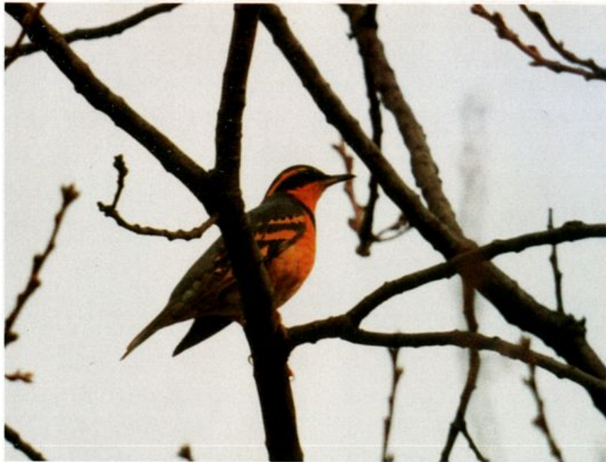
Male Varied Thrush at Signal Mountain, Tennessee, January 27, 1991. Apparently a first state record.