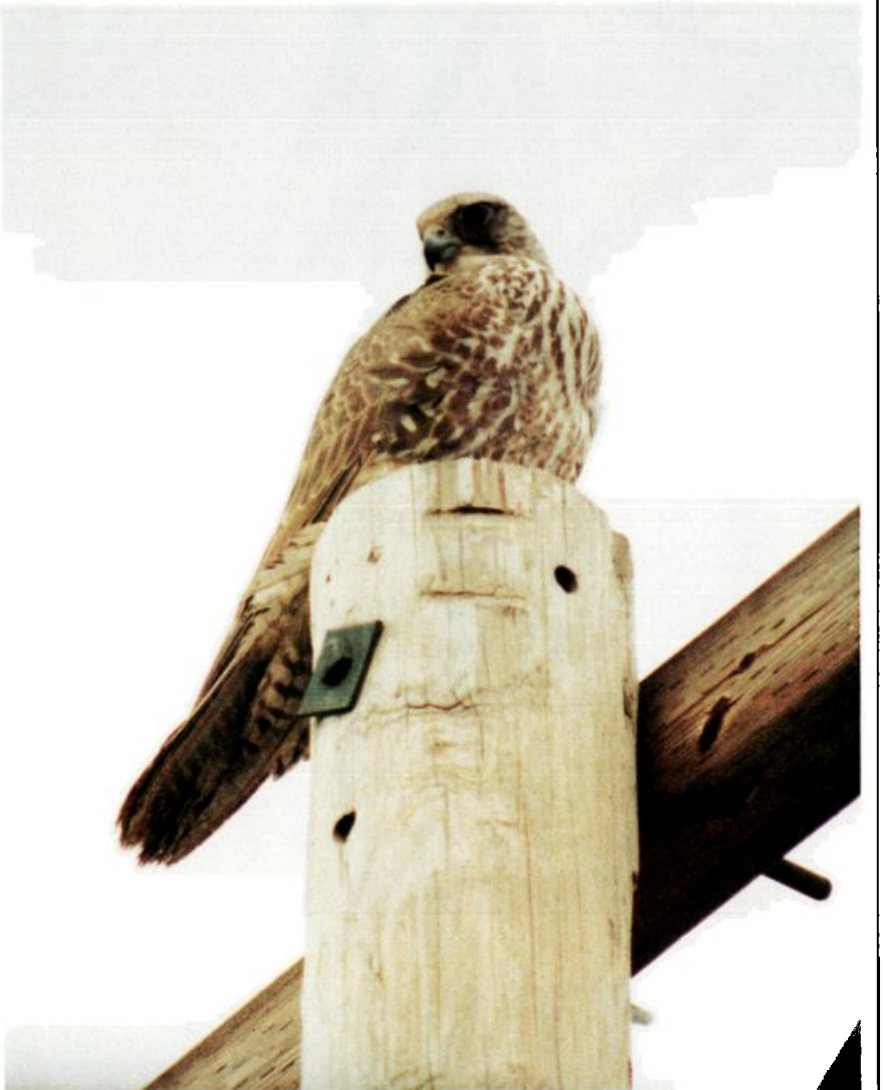
In many regions from Newfoundland to the Rockies, an invasion of Gyrfalcons was a highlight of the winter. As far south as Illinois, even one of these boreal raptors creates major excitement. This gray-morph immature was photographed February 17, 1991, in La Salle County, Illinois.