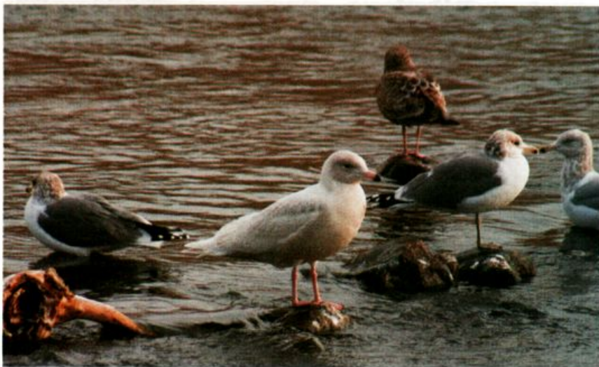
First-winter Glaucous Gull (center) with California Gulls east of Reno, Nevada, January 10, 1991. Third record for northern Nevada.