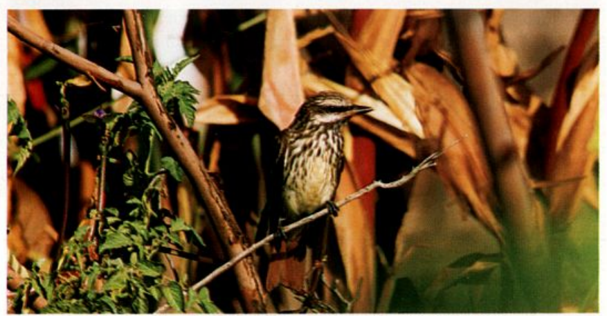
Sulphur-bellied Flycatcher at Goleta, California, September 26, 1990. Sixth California record.