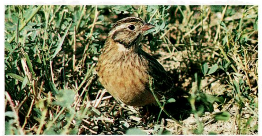
Smith's Longspur at Amargosa Valley, Nevada, October 19, 1990. First state record, and an unusually fine view of this elusive bird.