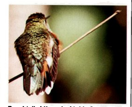
Broad-tailed Hummingbird in Seward County, Nebraska, October 1990. For most birds this would not be considered an optimum view, but it's perfect for the Selasphorus group of hummingbirds, since the important details are in the tail.