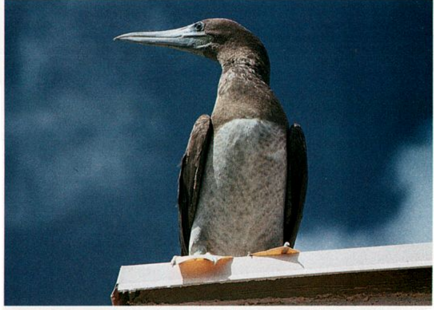
Subadult Brown Booby on a rooftop in Phoenix, Arizona, September 20, 1990. First record for the Phoenix area. An extension of the sulid invasion of summer 1990, which had brought Blue-footed and Brown boobies into southern California for the first time in years.