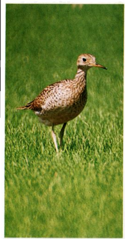
Upland Sandpiper near Oxnard, California, September 16, 1990. Fifth fall record for southern California.