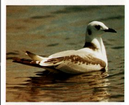
Juvenile Black-legged Kittiwake at South Hero, Vermont, August 20, 1990. This seagoing species has appeared in landlocked Vermont for the last three years straight.