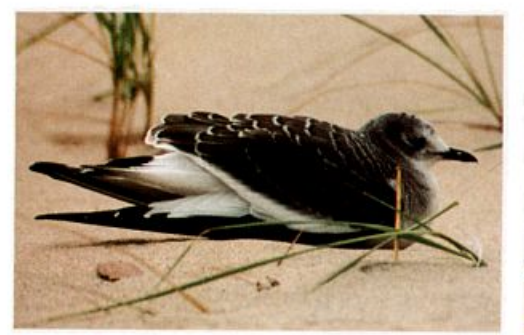
Juvenile Sabine's Gull on the beach at St. Joseph, Michigan, September 24, 1990. Up to five were in Michigan this season, perhaps an unprecedented number.