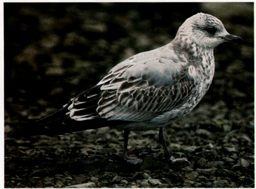
First-winter Mew Gull of the European race ( L. c. canus ) at St. John's, Newfoundland, October 25, 1990. This young bird had been banded in Iceland a few months before. Among other differences from first-winter Ring-billed Gull, notice that the dark centers of the wing coverts are rounded at the tip.