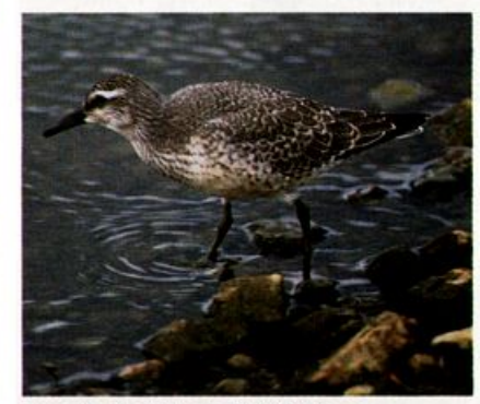
Juvenile Red Knot at Eaglet Lake, British Columbia, August 18, 1990. Second record for the interior of the province.