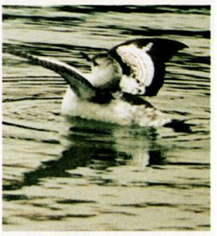
Immature Black Guillemot at Cleveland Lakefront State Park, Ohio, November 9, 1990. First record for Lake Erie and for the Middlewestern Prairie Region. The large white spots on the primary coverts (visible on the far wing, just beyond the solid white patch) suggest one of the races from Arctic Canada, rather than from the Atlantic Coast.