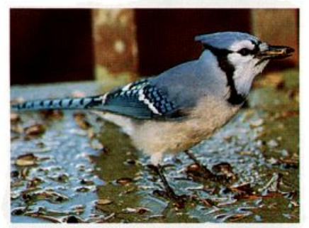
Blue Jay at Nakusp, British Columbia, November 1990. The fall of 1990 saw a noticeable influx of Blue Jays into the Pacific Northwest.