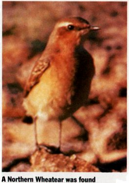
A Northern Wheatear was found October 18, 1990, at Lake Millwood, Arkansas. This was only the fourth record for the Central Southern Region, and the first for Arkansas.