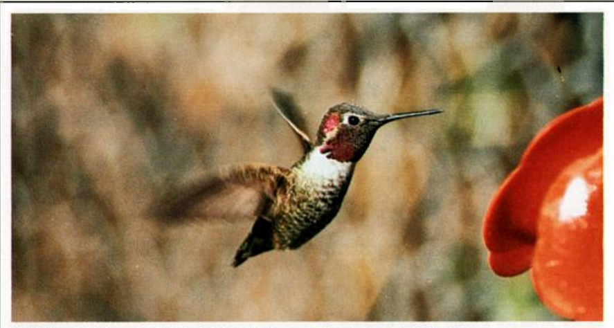
Male Anna's Hummingbird at Oxford, Kansas, October 25, 1990. This bird, which stayed for weeks, furnished a first state record.