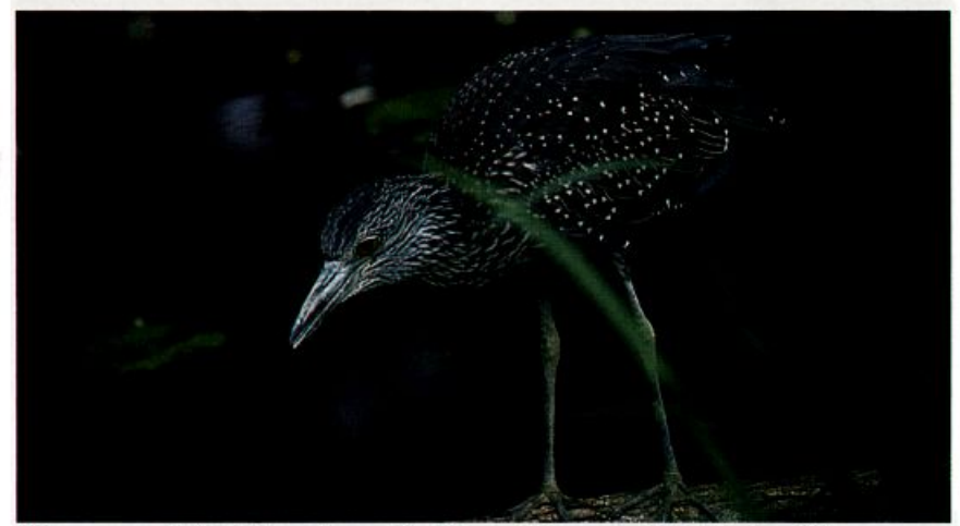
Yellow-crowned Night-Heron in very fresh juvenal plumage at Washington, DC, August 25, 1990. From the first known breeding in the District of Columbia since 1950.