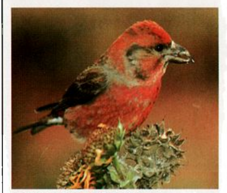
Red Crossbill in Alfalfa County. Oklahoma, November 4, 1990. A mild invasion reached the southern Great Plains in late fall.