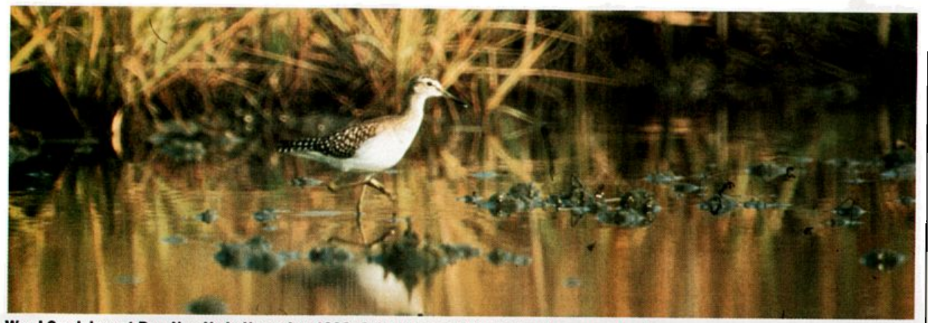
Wood Sandpiper at Rye, New York, November 1990. Only the second North American record outside of Alaska. Superficially much like a Solitary Sandpiper, this bird is paler and browner, and the strong "eyebrow" gives it a different facial expression.