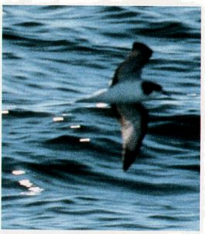
Steineger's Petrel 53 miles southwest of Point Reyes, California, November 17, 1990. The first confirmed record for North American waters — eleven years (exactly) after the first probable sighting.