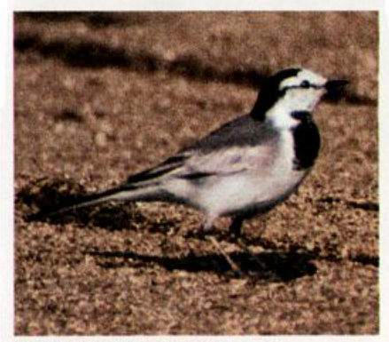
Adult White Wagtail at Saticoy, California, November 17, 1990. This may have been the same individual that had wintered here twice previously.