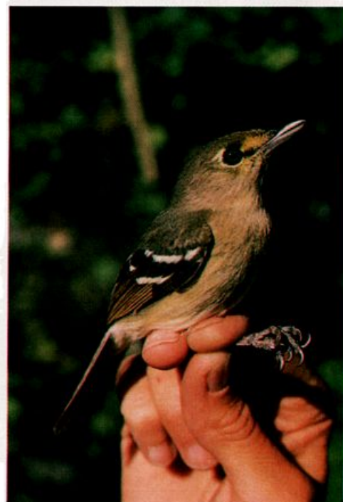
Figure 2. Thick-billed Vireo, Hypoluxo I., Florida. Note that the face, wing and bill are much like the typical individual pictured in Figure 1, and that the underparts could hardly be termed "uniform" or "yellow." The grayer-looking eye of this individual is not unusual.