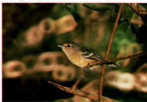
Figure 4. Molting Thick-billed Vireo, Cape Florida, Florida. This individual has a similar face and wing pattern to the bird in Figure 1 but has somewhat yellower underparts. Note the non-black bill.