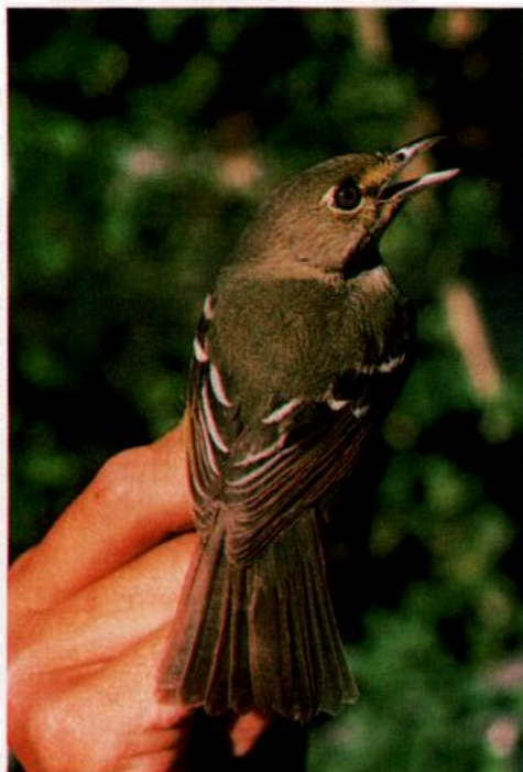
Figure 3. The same individual as in Figure 2. Note the prominent white edges to the tertials and fairly uniform olive upperparts (cf. Figure 1). Hypoluxo I., Florida.