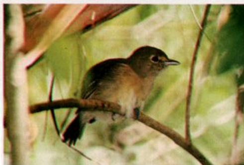
Figure 5. Another view of the Thick-billed Vireo at Cape Florida, Florida, showing the incomplete tail and very fine feathering below. At this angle, the throat appears more olive and the underparts more buffy. Again, note the non-black bill.