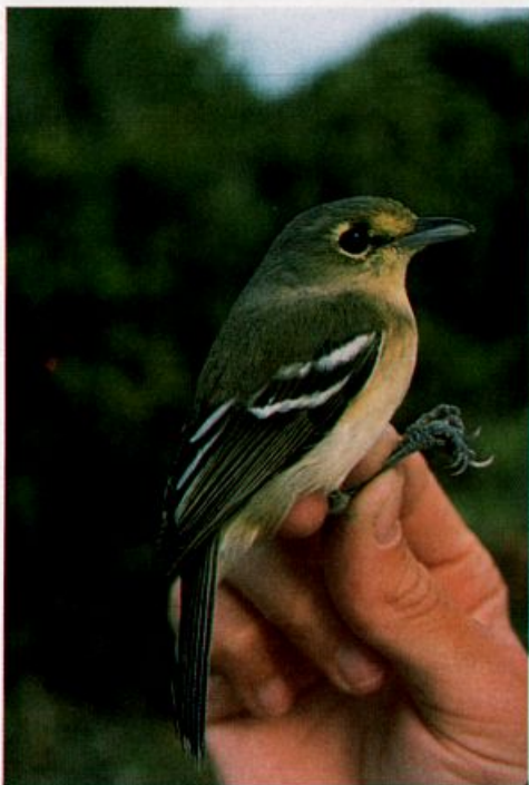
Figure 1. Typical Thick-billed Vireo from northern Bahamas, Abaco. Note yellow lores contrasting with whiter broken eye-ring, prominent white wingbars offsetting blackish greater coverts, fairly uniform upperparts, and dirty white, slightly yellowish underparts with some olive tones on the breast. This individual's bill is darker than some but still doesn't appear black.