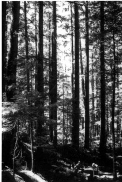
An old-growth stand east of Mt. Rainier. This stand is scheduled to be logged this summer. "The folks in the photograph are Audubon ancient forest activists."

The challenge to win the battle for ancient forests is immense. Obtaining a sustainable approach to forestry in the