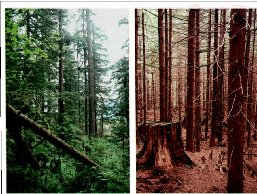
Ancient forest (left) and managed Douglas Fir forest (right) from adjacent stands in the Mt. Baker-Snoqualmie National Forest northeast of Seattle, Washington. The undisturbed old-growth forest contains at least 100 to 150 vascular and nonvascular plant species, while the managed stand has at most 15.

The final step in sovietization took place last year when political needs not only ignored biology but wrenched the decision away from the normal rule of law. An attachment to the 1990 appropriations bill (known as Section 318, the Hatfield-Adams amendment) de-