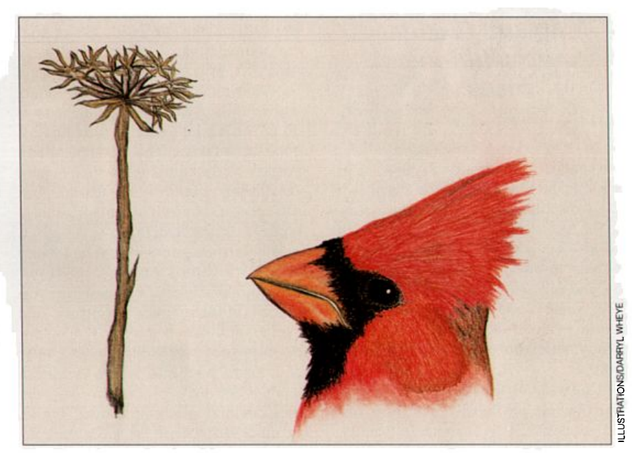
Northern Cardinals take primarily insects when they are breeding, while a wide variety of weed seeds is the mainstay of their winter diet. They may weather up to 15 winters.

dence, particularly by repeated tests that don't disprove them. After a hypothesis has stood many tests, it gradually develops into a theory. Science can be viewed as a webwork of hypotheses and theories that ties together our observations of the world and tries to make sense of them.