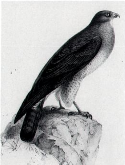
The 1829 Swainson's Hawk illustration by William Swainson, from Fauna Boreali-Americana , Vol. 2 (1832).

Drummond collected a female Swainson's Hawk on May 22, and a male on June 17, 1827, at nests near Carlton. Both were described by Richardson and one was illustrated by artist William Swainson in Fauna Boreali-Americana , Vol. 2 (1832). Although both Richardson and Audubon (1837) had considered this bird conspecific with Buteo vulgaris , the Common Buzzard of Europe, Charles Lucien Bonaparte recognized the priority of these speci-