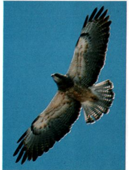
"My own banding results have provided a picture of the complete migration process."

I have watched Swainson's Hawks with interest since my boyhood in