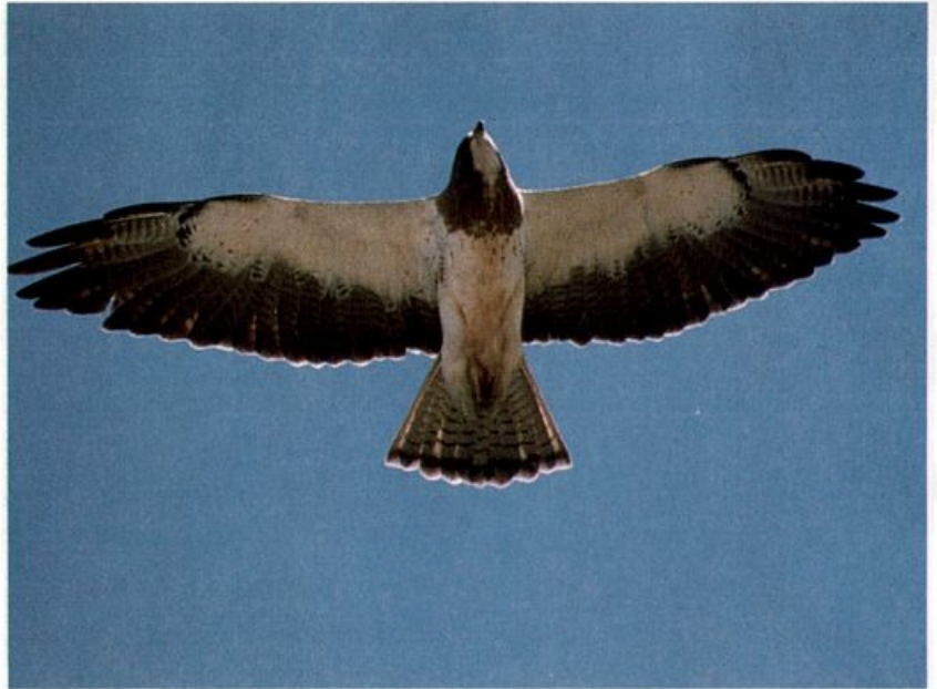
Annual records of the birds are impressive: all travel in constant compass direction about 40 degrees east of south, and due to undulating contours of land, will have travelled even farther than the direct distance of up to 7,000 miles. The 11-year-old bird will have made 11 trips of this distance to Argentina, or close to 150,000 miles, a distance equal to that achieved during the "life" of the average car!

America because their logical wintering area, Texas and northern Mexico, is already heavily populated or saturated in winter by larger buteos, the Ferruginous, Red-tailed and Rough-legged hawks? Is there insufficient or inappropriate food for them in Texas and Mexico?