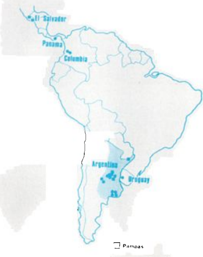
Figure 1—Map of Saskatchewan-banded Swainson's Hawks recovered in Central and South America. Squares = same calendar year as banded. Circles = subsequent years.

of this distance to Argentina and ten journeys back north, or close to 150,000 miles, a distance equal to that achieved during the "life" of the average motor car!