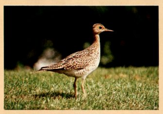
Juvenile Upland Sandpiper at Ventura, California, August 28, 1989.