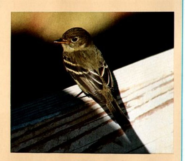
An apparent Yellow-bellied Flycatcher at Galileo Hill, California, September 30, 1989.