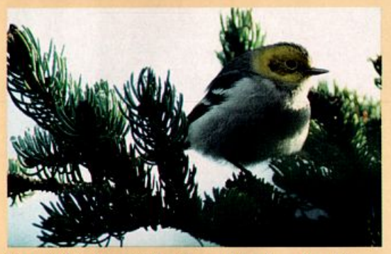
Hermit Warbler at Blackhead, Newfoundland, in November 1989. Another in the long string of remarkable warbler records for Newfoundland, this bird furnished a first record for the province and one of few ever in eastern North America.