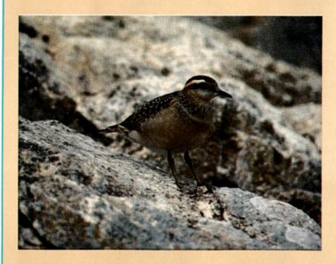
Juvenile Eurasian Dotterel on the rocks of Southeast Farallon Island, California, September 15, 1989. Fourth state record.