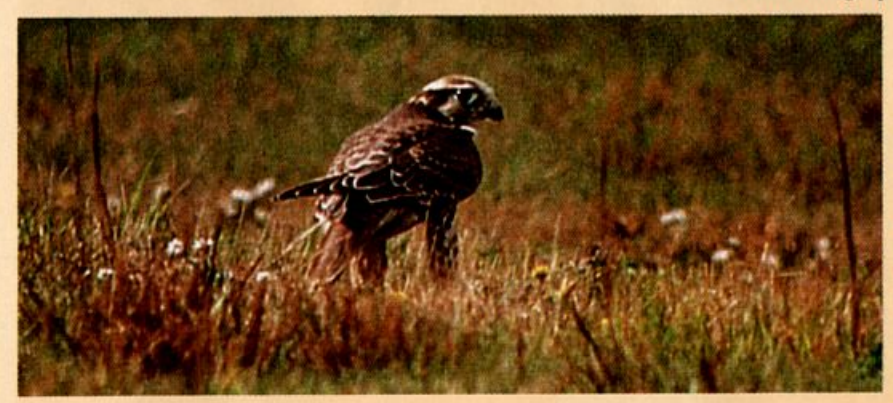
This falcon on Block Island, Rhode Island, on October 7, 1989, was identified as a Prairie Falcon. If the bird was not a falconer's escapee (and if all other species of pale falcons around the world can be ruled out), this would be a first for New England.

Juvenile Lesser Golden-Plover at Kettle Point, Ontario, November 1989. As expected for most of the continent, this bird appears to be of the grayer "American" form (dominica).