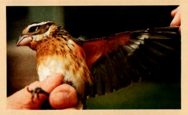
An apparent hybrid Rose-breasted X Black-headed Grosbeak banded at Ogden, Utah, September 8, 1989.