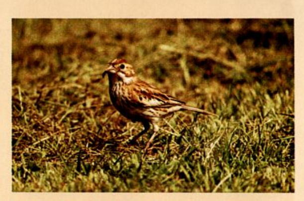
Lark Bunting in Middlesex County, New Jersey, August 30, 1989.