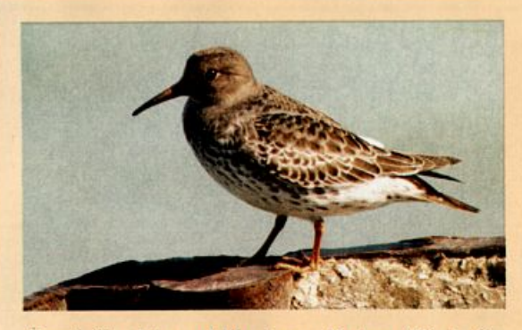
Purple Sandpiper at Waukegan Harbor, Illinois, October - November 1989.