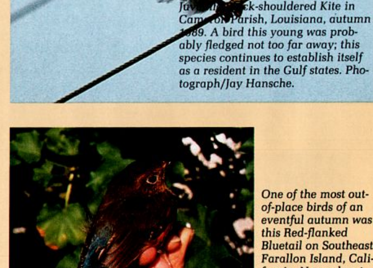
One of the most outof-place birds of an eventful autumn was this Red-flanked Bluetail on Southeast Farallon Island, California, November 1, 1989.