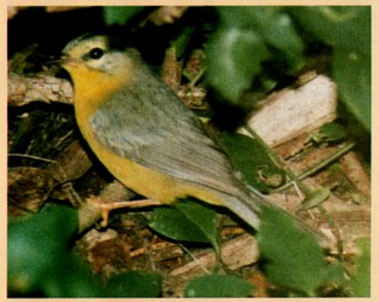
Golden-crowned Warbler at Sabal Palm Sanctuary, Brownsville, Texas, November 24, 1989. About the seventh state record, and an unusually good photograph of this subtle and elusive species.