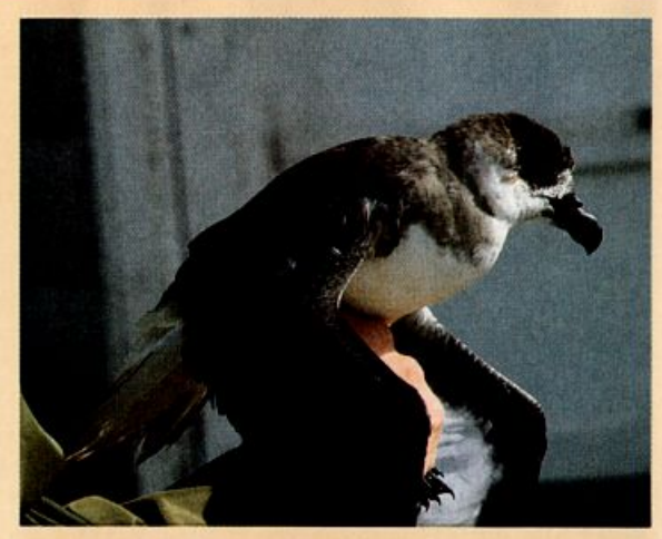
One of three Black-capped Petrels found in Venango County, Pennsylvania, September 25, 1989, after the passage of Hurricane Hugo.