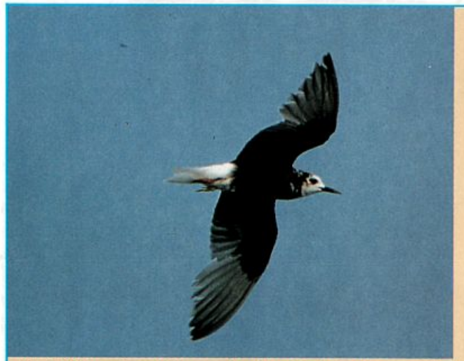
Adult White-winged Tern at Bombay Hook, Delaware, July 22, 1989.