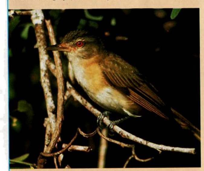
Yellow-green Vireo at Laguna Atascosa National Wildlife Refuge, Texas, July 9, 1989. A pair of these vireos nested at the refuge this season.