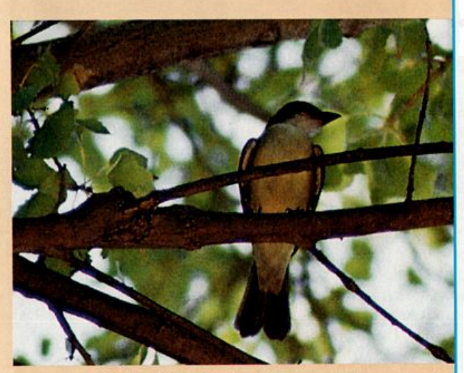
Juvenile Thick-billed Kingbird at Cottonwood Campground, Big Bend National Park, Texas, July 29, 1989. This bird fledged from the first known Texas nest.