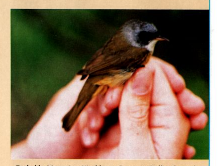
Probable Mourning Warbler x Common Yellowthroat hybrid at Sherbrooke, Quebec, June 2, 1989.