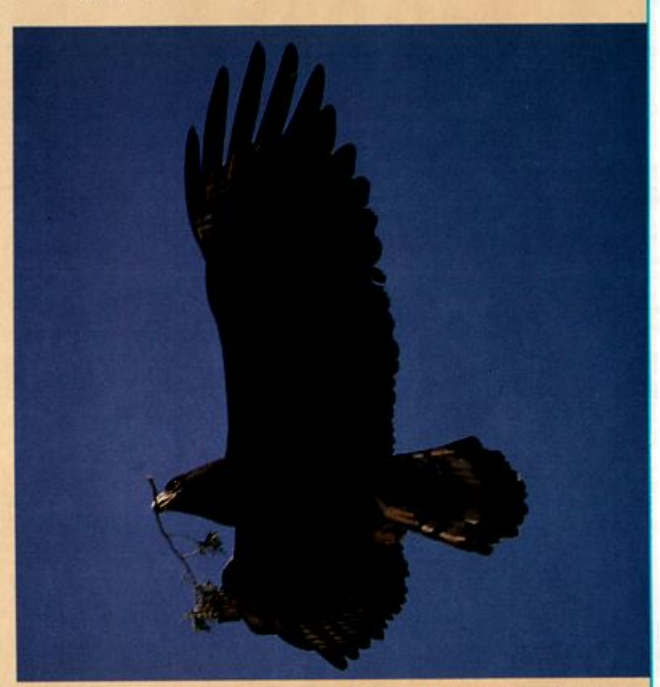
Zone-tailed Hawk carrying nest material at Devil's River State Natural Area, Texas, April 22, 1989. The species is local as a breeder in the Texas hill country.