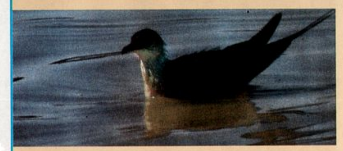
Adult Long-tailed Jaeger at Carson Lake, Nevada, August 11, 1989. This bird, the second Long-tailed for the state, apparently arrived in mid-July.