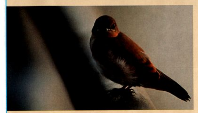
Northern Rough-winged Swallow at Washington, D.C., June 24, 1989. In very fresh juvenal plumage, this bird shows broad rusty edges on the tertials and a wash of buff on the throat.