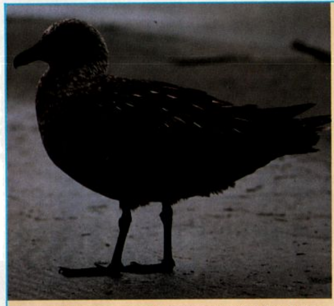
In one of the most astounding records of the decade, this skua—probably a South Polar Skua—was found July 13, 1989, on Lake Oahe, North Dakota.