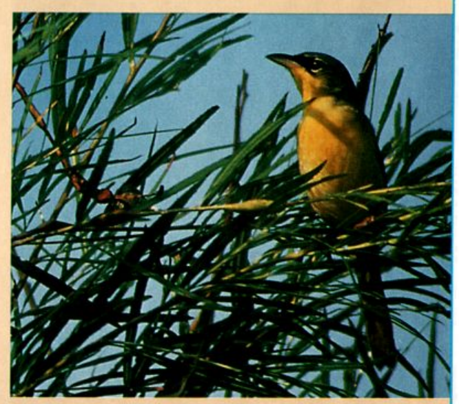
Male Gray-crowned Yellowthroat at the Sabal Palm Grove, Texas, June 6, 1989.