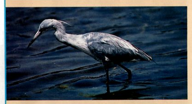
This bird at Marina del Rey, California, was variously considered to be either a Little Blue Heron x Snowy Egret hybrid or a partially albinistic Little Blue Heron. As seen in this photo, the bird had the bill pattern, bill shape, and foraging posture of a Little Blue, suggesting that the latter identification was correct.