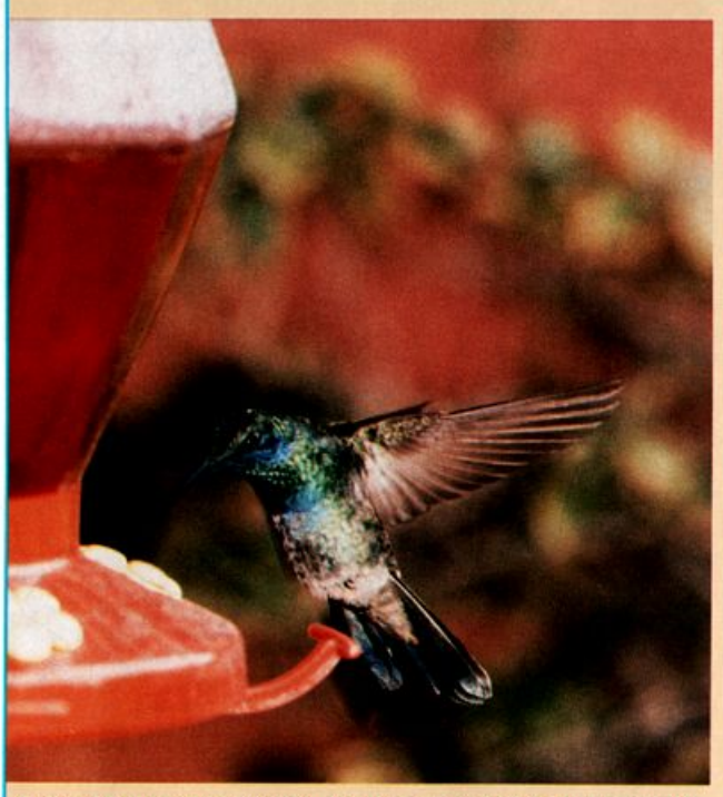
Green Violet-ear at Sinton, Texas, July 6, 1989.