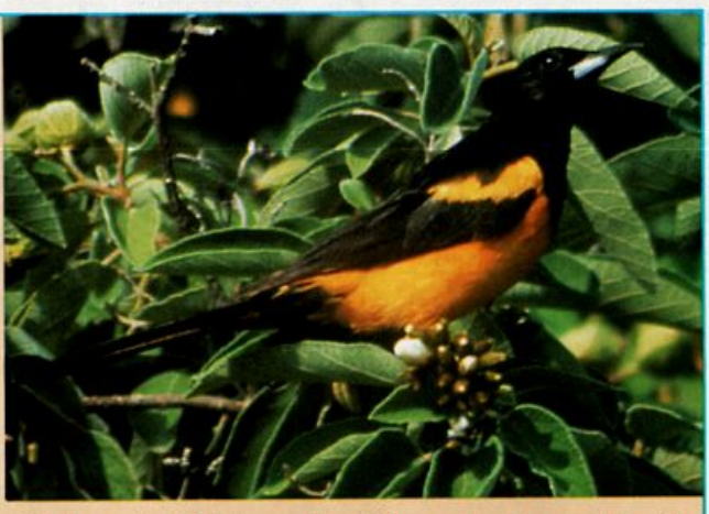
Black-vented Oriole south of Kingsville, Texas, July 29, 1989. Second documented record for the United States.