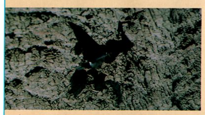
Violet-green Swallow entering a nest at the North Unit of Theodore Roosevelt National Park, North Dakota, July 8, 1989. First confirmation of breeding for the state.