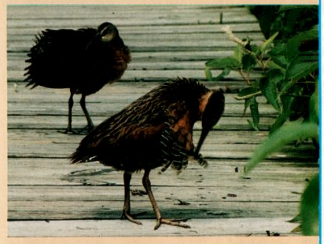
Pair of King Rails (male in foreground) preening on the boardwalk at Huntley Meadows County Park in Fairfax County, Virginia, July 15, 1989.