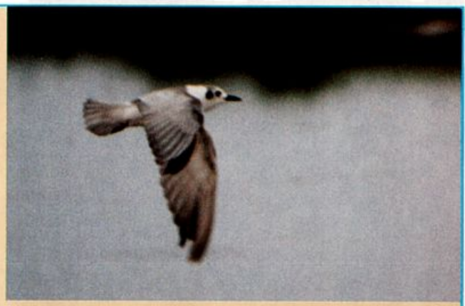
White-winged Tern in first-summer plumage at Cape May, New Jersey, June 5, 1989. This age class of the species had apparently never been found in North America before.