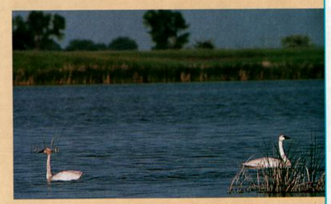
Trumpeter Swan (the larger bird) and Tundra Swan at Lake Lunby, Grand Forks County, North Dakota, June 10, 1989.