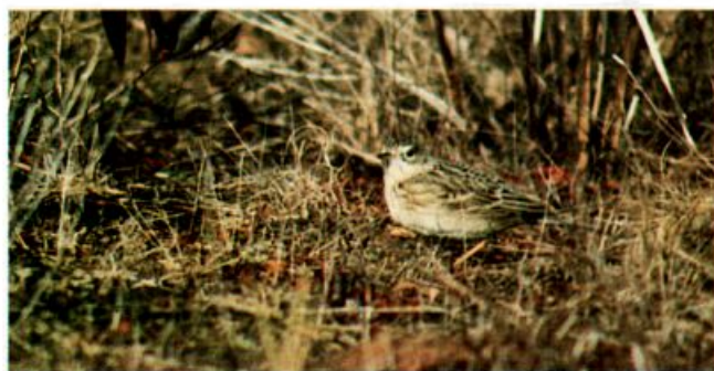
Sprague's Pipit at Provincetown Airport, Massachusetts, December 22, 1988. First record for the state, and first confirmed for New England.