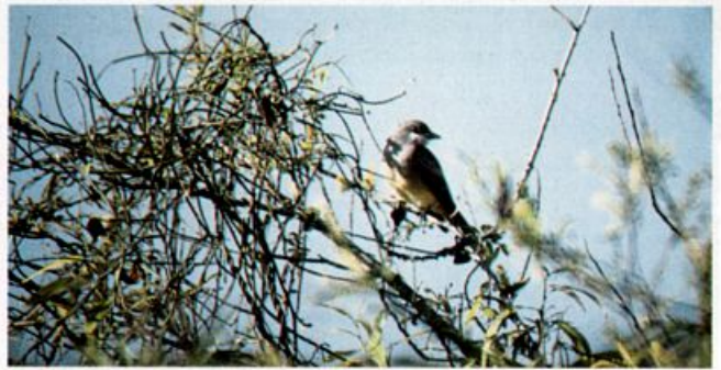
Cassin's Kingbird at Loxahatchee National Wildlife Refuge, Florida, January 5, 1989. First documented state record.