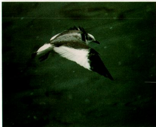
Sabine's Gull in first-winter plumage at Cleveland, Ohio, February 4, 1989. This individual, present for weeks, established one of the very few winter records for North America.