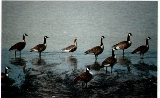
Greater White-fronted Goose (with Canada Geese) in Gallia County, Ohio, February 18, 1989.