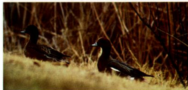
Male Eurasian Wigeon at Santa Teresa, New Mexico, January 4, 1989. First documented record for the state.