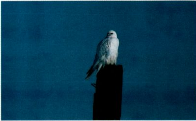
Gyrfalcon of the white morph near Fort Peck, Montana, February 18, 1989.