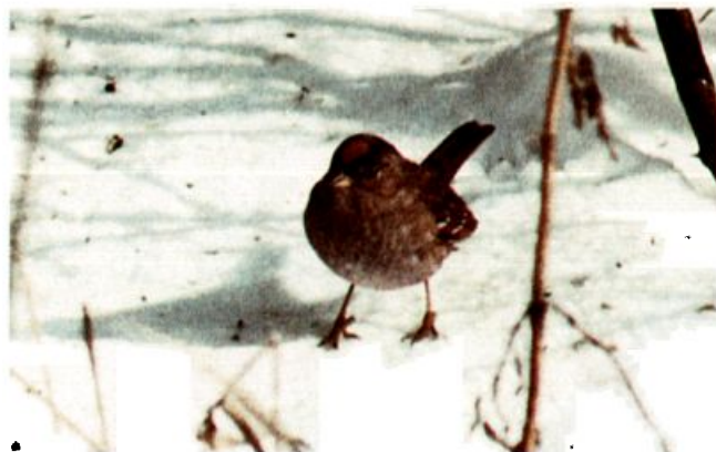
Adult Golden-crowned Sparrow in Lee County, Illinois, February 22, 1989. Third state record.