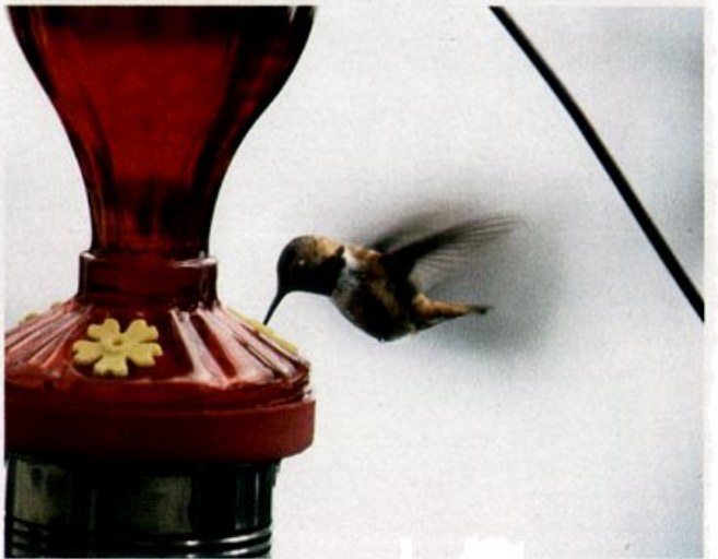
Adult male Rufous Hummingbird at Parsons, West Virginia, December 20, 1988.