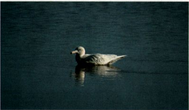
Glaucous Gull in first-winter plumage on Woods Reservoir, Tennessee, January 18, 1989.