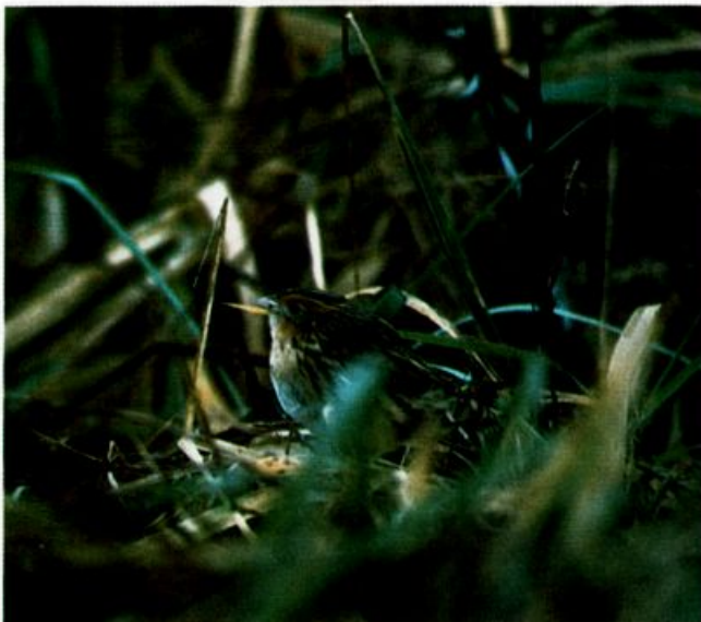
Le Conte's Sparrow in Del Norte County, California, January 8, 1989. First wintering individual for northern California.