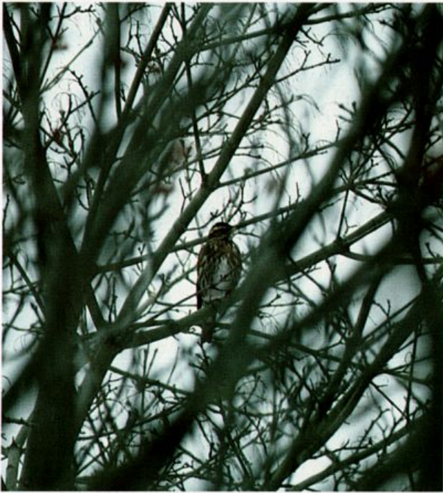
Redwing at St. John's, Newfoundland, January 29, 1989. Fourth record for the province and for Canada.