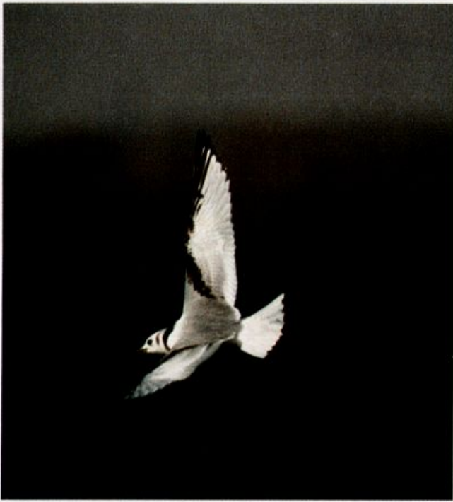
Black-legged Kittiwake in first-winter plumage at Lake Overholser, Oklahoma, March 4, 1989.