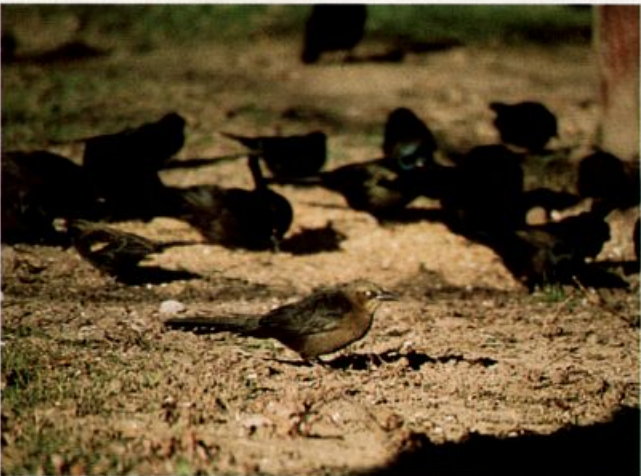
Female Great-tailed Grackle (with Common Grackles and Red-winged Blackbirds) at Port Rowan, Ontario, December 4, 1988. Second record for the province.