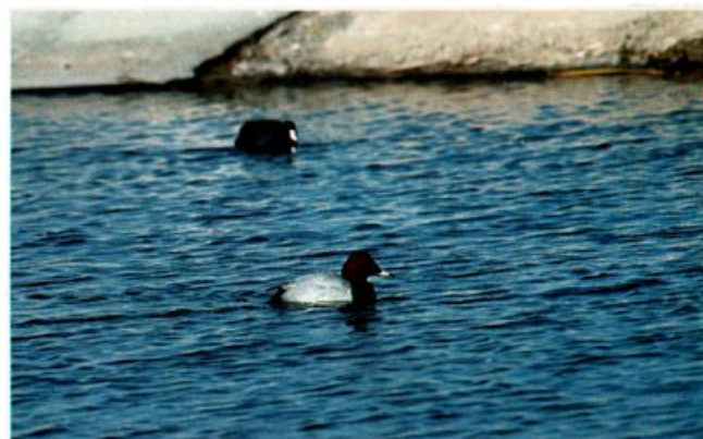
Male Common Pochard at Silver Lakes, California, February 14, 1989. Although there are no previous records south of Alaska along the Pacific Coast, this bird was thought by many to be a genuine wild vagrant.