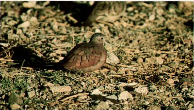
Ruddy Ground-Dove at Lukeville, Arizona, January 2, 1989.