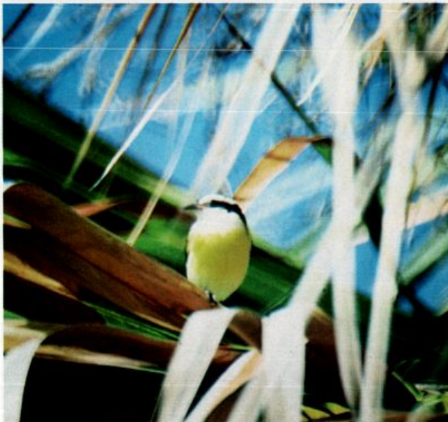
Bananaquit at Lloyd State Park, Florida, February 10, 1989.