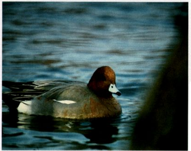
Male Eurasian Wigeon at Drayton Plains, Michigan, January 31, 1989.