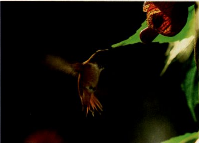
Male Rufous Hummingbird at New Orleans, Louisiana, February 26, 1989. The species is now known to winter regularly in small numbers in this area.