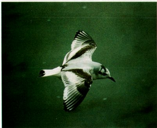
Little Gull in first-winter plumage at Cleveland, Ohio, February 4, 1989. The thin bill, capped appearance, and "kittiwake" wing pattern can all be appreciated in this portrait.