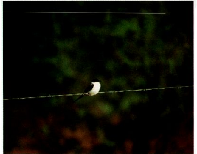
Fork-tailed Flycatcher near Ricardo, Texas, December 20, 1988. Most North American records involve the migratory race from southern South America, but this individual was apparently of the northern race T. s. monachus .