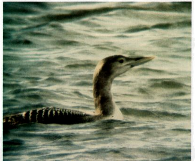
Yellow-billed Loon in first-winter plumage on Lake Yahola near Tulsa, Oklahoma, December 14, 1988. First state record.