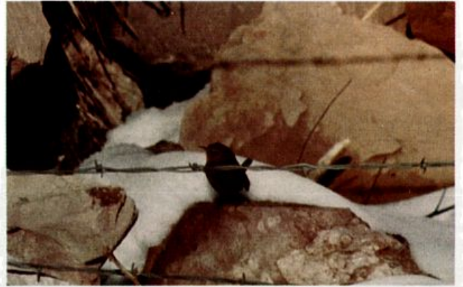
Winter Wren in Larimer County, Colorado, January 29, 1989.