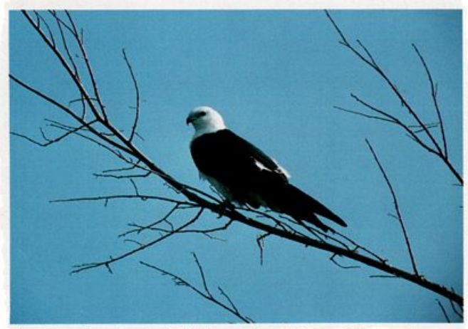
American Swallow-tailed Kite at Point Pelee, Ontario, late August-early September 1988.