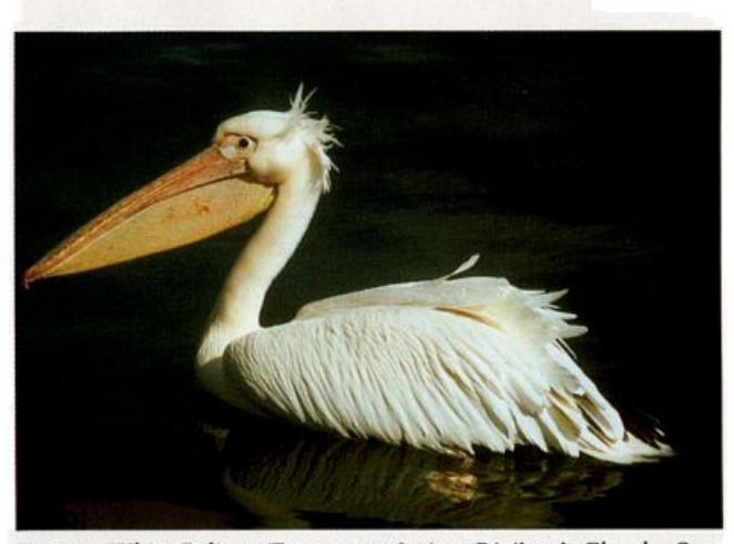
Eastern White Pelican (P. onocrotalus) at Rivière-à-Claude, Quebec, September 24, 1988. The bird was immediately suspected (and later proven) to be an escapee.