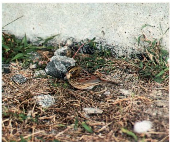
Henslow's Sparrow, not often detected in migration, at the Chesapeake Bay Bridge and Tunnel, Virginia, October 8, 1988.