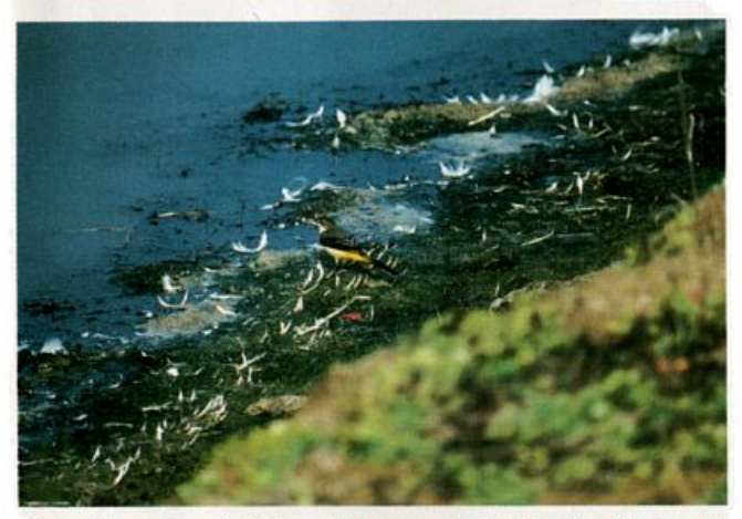
Gray Wagtail at the Salinas Rivermouth, California, October 10, 1988. A first for California and for the Lower 48 States, this was thought perhaps to be the "best" of the many outstanding rarities in the Region this season.