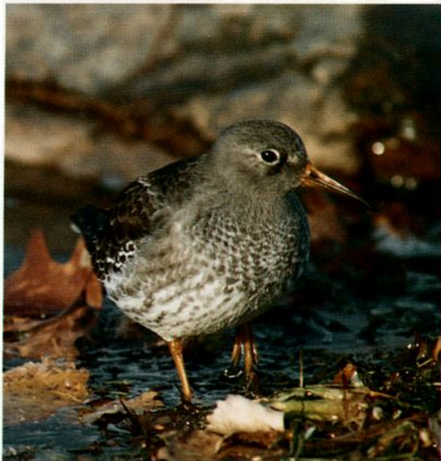
One of nine Purple Sandpipers found November 6, 1988, at Grand Isle, Vermont. The species is a very rare visitor there.