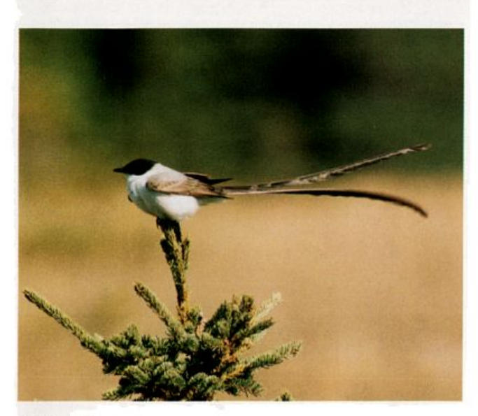
Fork-tailed Flycatcher at Port-Menier, Anticosti Island, Quebec, September 25, 1988.