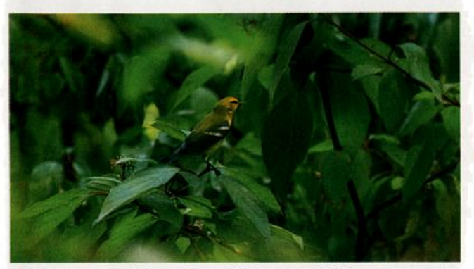
Blue-winged Warbler at Grand Forks, North Dakota, August 31. 1988. Photograph/David Lambeth.