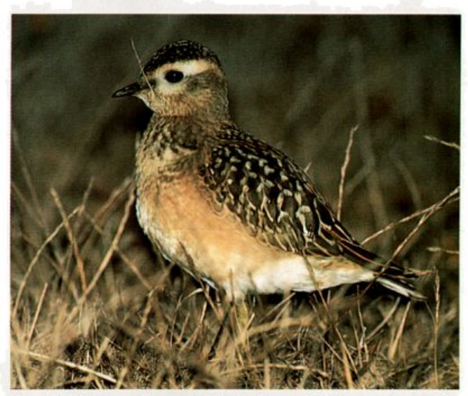
Juvenile Eurasian Dotterel at Point Reyes, California, September 10, 1988. Third state record.