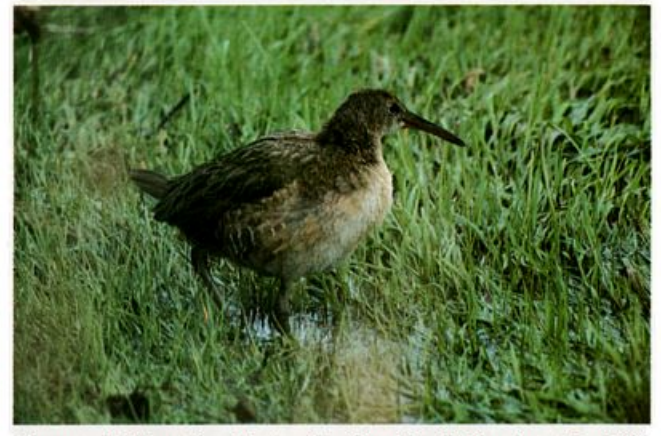
Clapper Rail at St. John's, Newfoundland, October 16, 1988. Second provincial record.