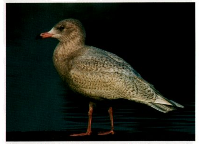
Glaucous Gull in first-winter plumage at Phoenix, Arizona, November 26, 1988. A long-awaited first state record.