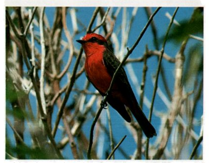
Adult male Vermilion Flycatcher at Sun City Center, south of Tampa, Florida, October 1988. This may have been the same individual that had spent the preceding winter at this precise location.