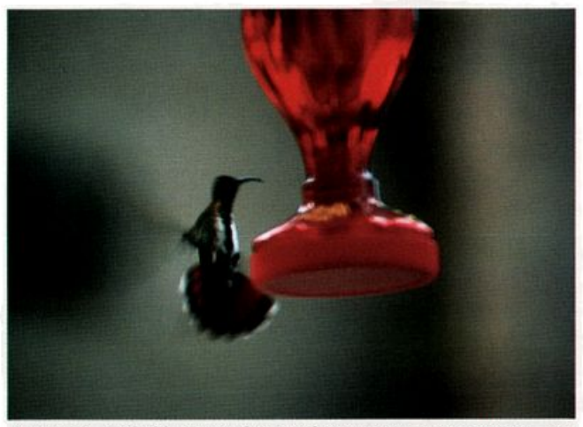
A mango, probably Green-breasted Mango (Anthracothorax prevostii) from Mexico, in Brownsville, Texas, September 18, 1988. First record of this genus for the United States.