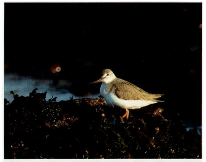
Terek Sandpiper at Carmel, California, Augsut 28, 1988. First for California and for the Lower 48 States.