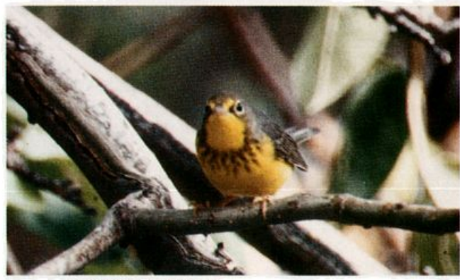
Canada Warbler at Malheur National Wildlife Refuge, Oregon, September 3, 1988. Second state record.