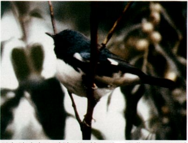
Male Black-throated Blue Warbler at Crow Valley Campground, Pawnee National Grassland, Colorado, September 14, 1988.