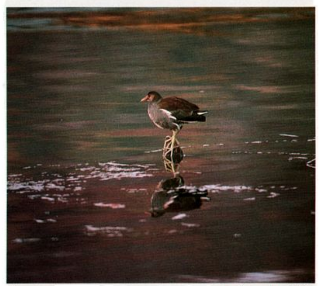
Common Moorhen in Cabell County, Ohio, November 1988.