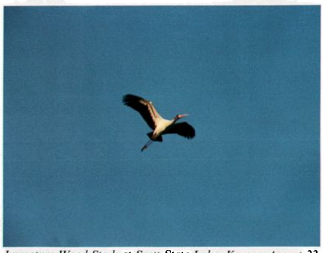
Immature Wood Stork at Scott State Lake, Kansas, August 22 1988.