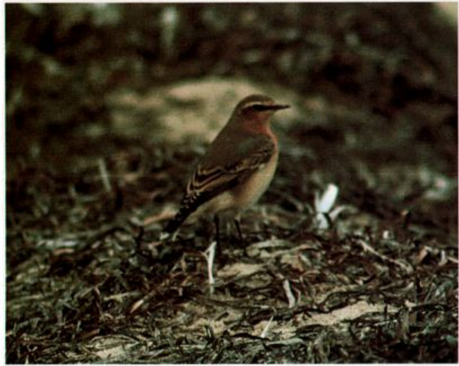
Northern Wheatear (one of four in the Region this fall) at South Harwich, Massachusetts, October 3, 1988.