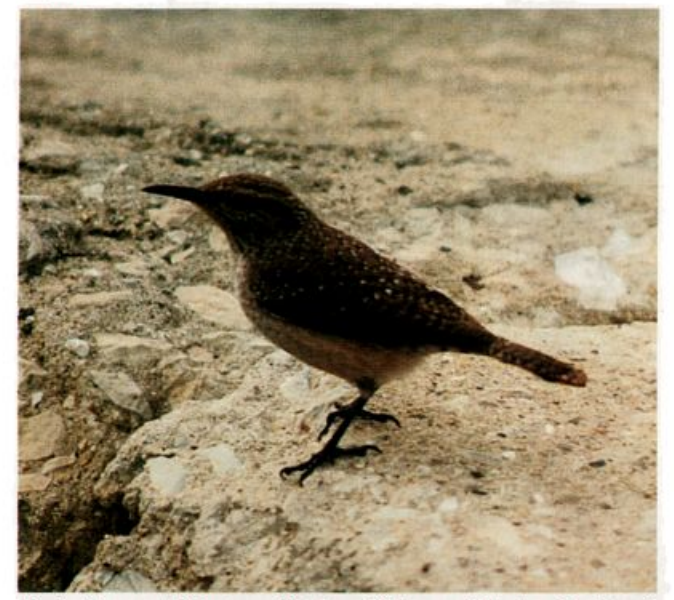
Rock Wren at Montrose Harbor, Chicago, Illinois, October 8, 1988.