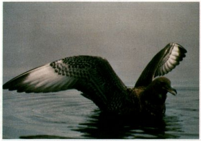
Juvenile Pomarine Jaeger at Saylorville Reservoir, Iowa, September 30, 1988. Notice the unstreaked dark head, pale-based bill, and white crescent on the greater underprimary-coverts.