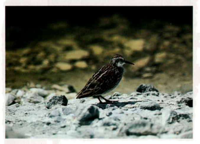
Long-toed Stint at Salinas, California, August 30, 1988.