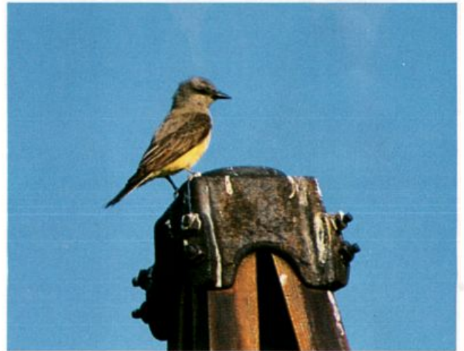
Western Kingbird above nest at Winn, Michigan, July 9, 1988.