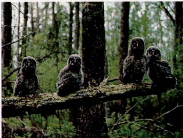
Young Great Gray Owls from the nesting in Ashland County, Wisconsin, May 21, 1988.