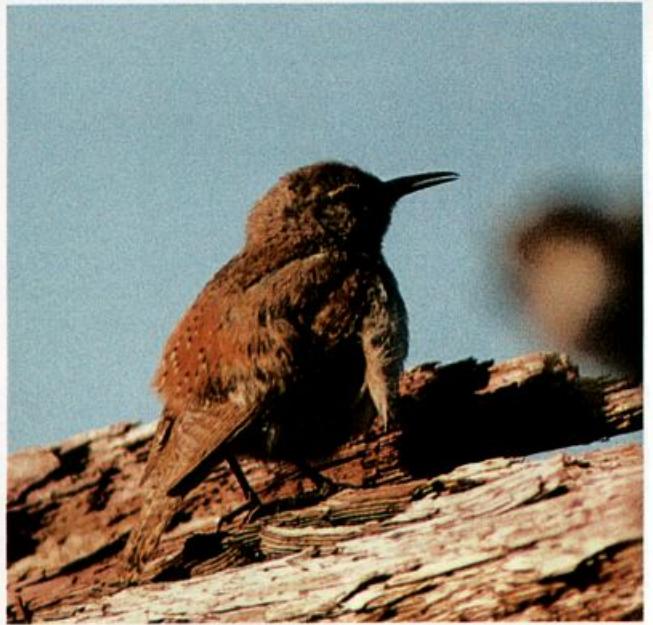
Rock Wren at Centennial, Michigan, July 14, 1988.