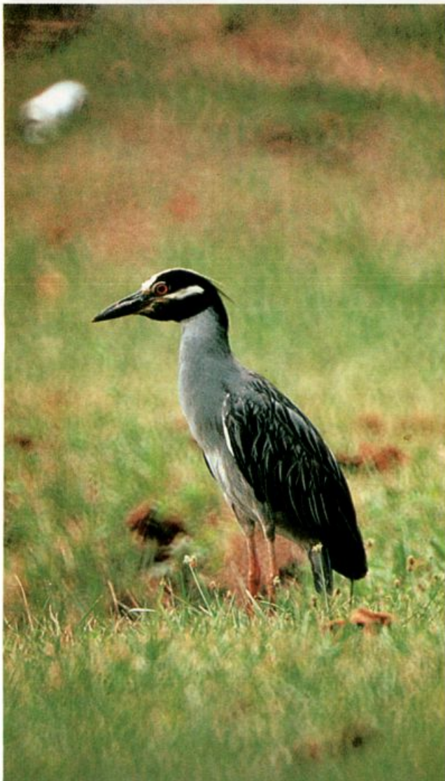
Adult Yellow-crowned Night-Heron at Point Pleasant, West Virginia, July 23, 1988.