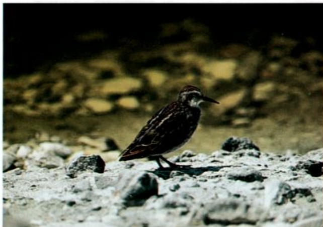
Long-toed Stint at Salinas, California, August 30, 1988.