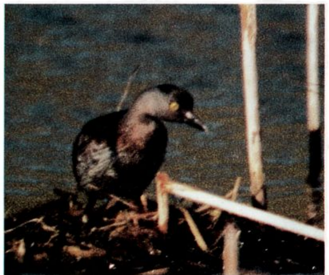
Least Grebe on nest in Karnes County, Texas, May 22, 1988.