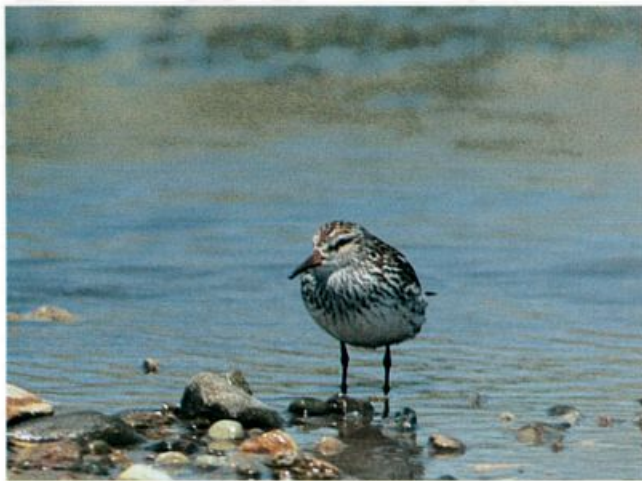
White-rumped Sandpiper at McGrath State Beach, California, June 11, 1988.