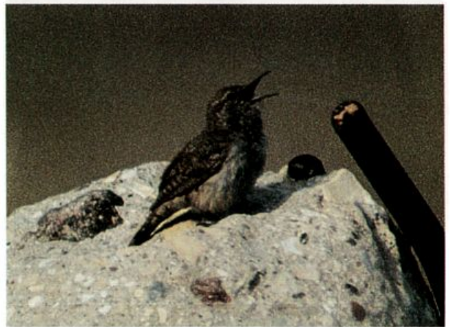
Rock Wren singing at Churchill, Manitoba, July 1, 1988. A pair nested in the area this season. Even though the species is very rare in Manitoba, it had nested at least once before at Churchill.