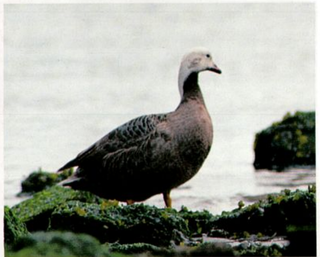
Emperor Goose at Tokeland, Washington, April 24, 1988.