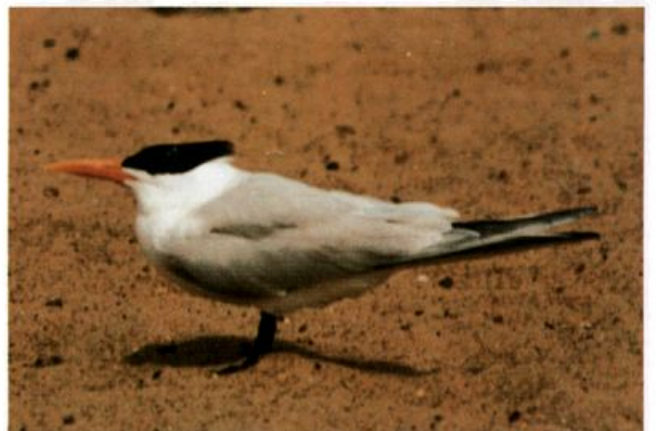
Adult Royal Tern at Chicago's Montrose Harbor, July 13, 1988. Extremely rare inland.