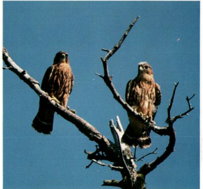
Merlins (adult with juvenile) on Campobello I., New Brunswick, Aug. 12, 1988. The species is scarce as a breeder this far south in the region.