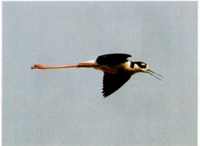
Black-necked Stilt near suspected nest site in Throckmorton County, Texas, June 11, 1988.