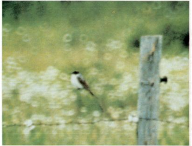
Fork-tailed Flycatcher—always cause for excitement in North America—in Douglas County, Wisconsin, June 24, 1988.