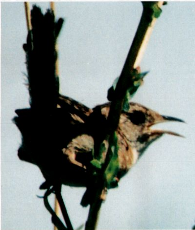
Sedge Wren at South Cape May Meadows, New Jersey, Aug. 12, 1988. The species staged a surprising late-summer incursion this year.