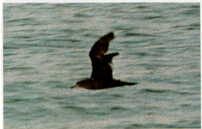
Eat your heart out: Wedge-Tailed Shearwater at the north end of the Salton Sea, California, July 31 (only), 1988. Just the second record for the United States.