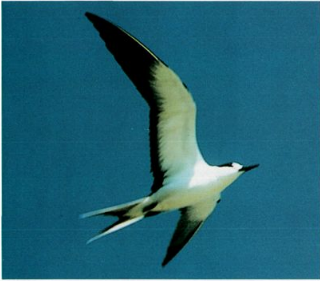
Sooty Tern near site on lower Laguna Madre, Texas, July 1988.