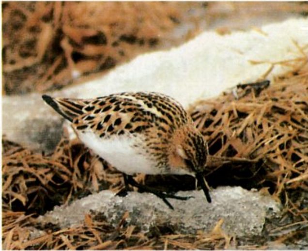
Adult Little Stint at Gambell, St. Lawrence Island, Alaska, early June, 1988.