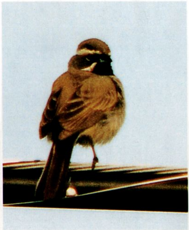
Black-throated Sparrow in Geauga County, Ohio, June 19, 1988.