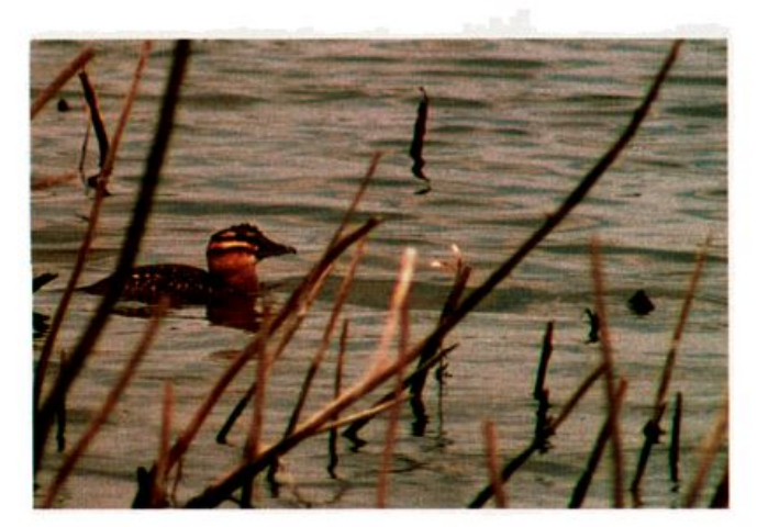
Masked Duck near Rio Hondo, Texas, April 22, 1988.