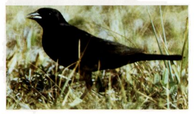
Male Shiny Cowbird at Ft. Jefferson, Dry Tortugas, April 26, 1988.