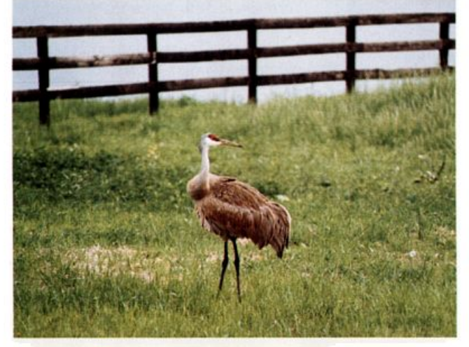
Sandhill Crane at Upperville, Virginia, late May 1988. About the 11th or 12th record for Virginia.