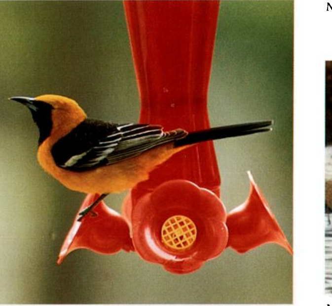
Male Hooded Oriole at Bend, Oregon, April 17, 1988.