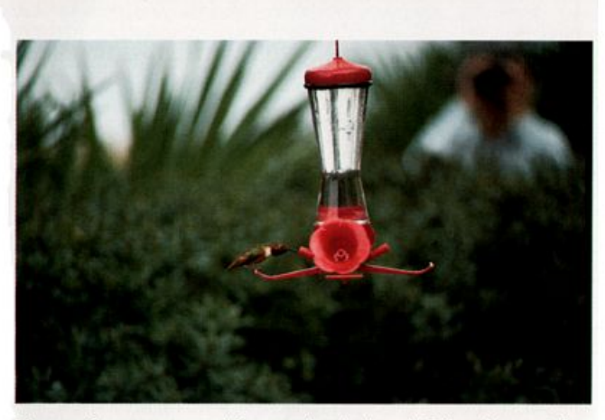
Center of controversy: this green-backed male Selasphorus (photographed February 28, 1988, at Cedar Key, Florida) may have been an Allen's Hummingbird, but positive field identification is almost impossible.