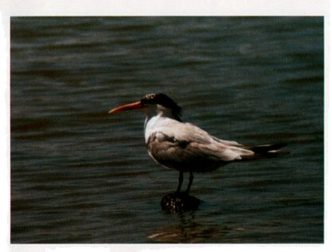
Elegant Tern at Painted Rock Dam, Arizona, May 30, 1988. First definite Arizona record, and one of very few inland records ever for the species.