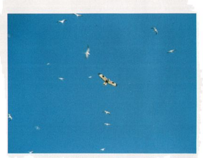
Rough-legged Hawk being mobbed by Sooty Terns at Laysan Island, Hawaii, March 4, 1988. First record in Hawaii for any Buteo other than the endemic 'Io (Hawaiian Hawk).