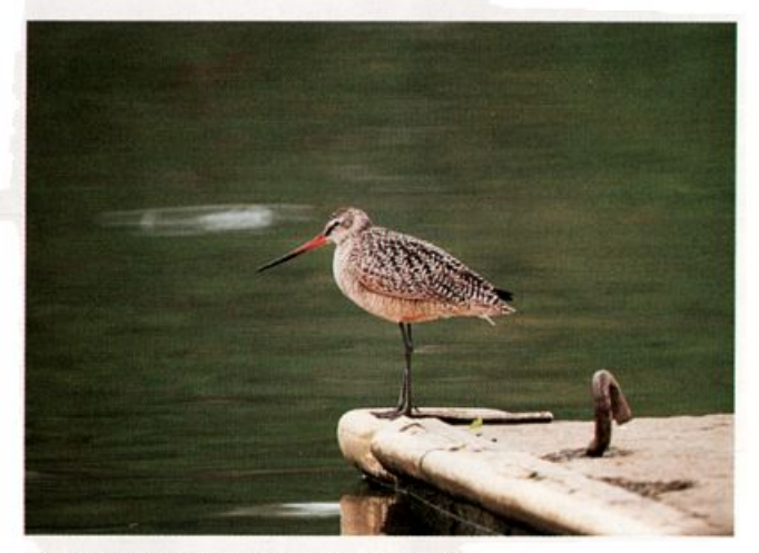
Marbled Godwit at Huntington, West Virginia, April 21, 1988.