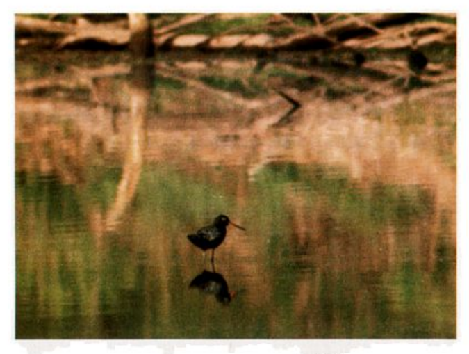
Spotted Redshank at Lake Perry, Jefferson County, Kansas, May 1988. First record for the state and Region.