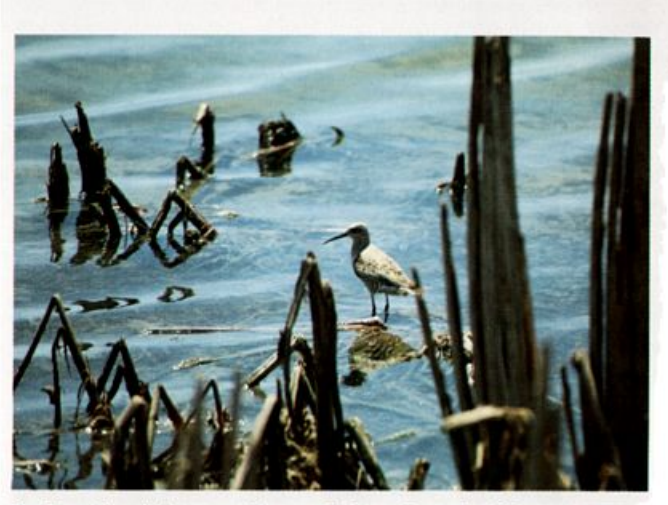
Curlew Sandpiper at Stoney Point, Ontario, May 14, 1988.