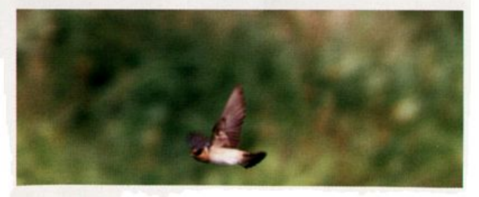
Cave Swallow in St. Tammany Parish, Louisiana, May 8, 1988.