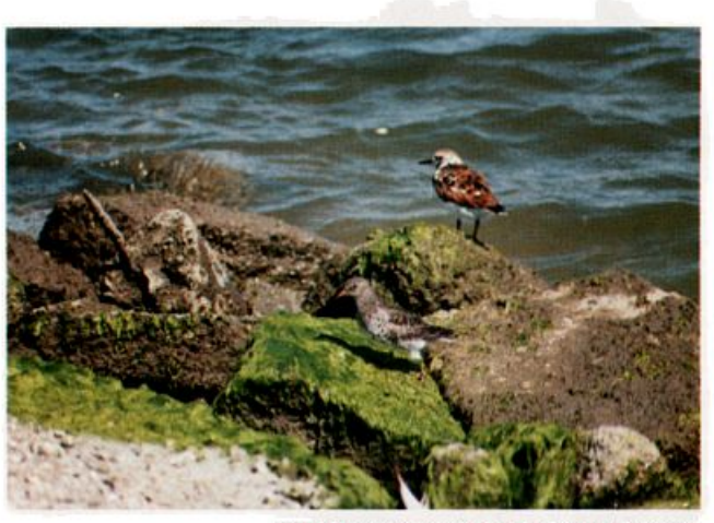
Purple Sandpiper (with Ruddy Turnstone) at Gulfport, Mississippi, April 11, 1988. Second documented Mississippi record.