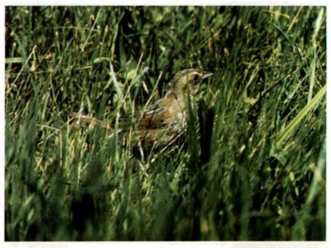
The species is rarely found away from the immediate coast and this Seaside Sparrow provided a first record for the Dis trict of Columbia on May 7, 1988.