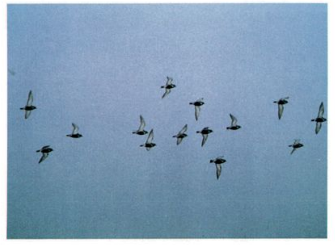
Part of a flock of Greater Golden-Plovers at Kilbride, Newfoundland, April 26, 1988. The species staged an unprecedented invasion this spring.