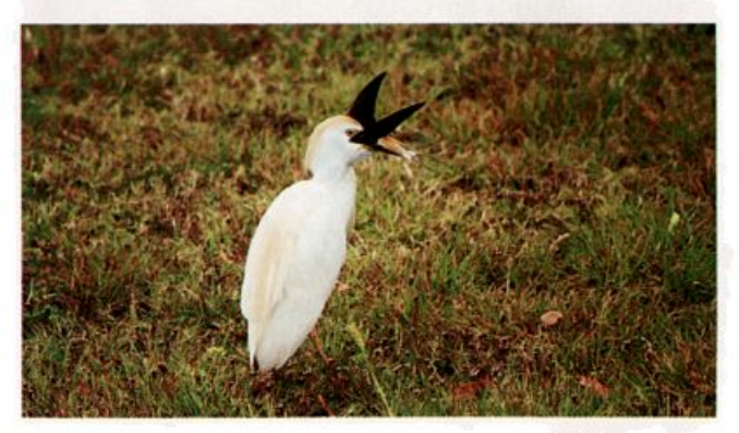
Cattle Egret attempting to swallow a Barn Swallow on the Dry Tortugas, Florida, May 1, 1988.