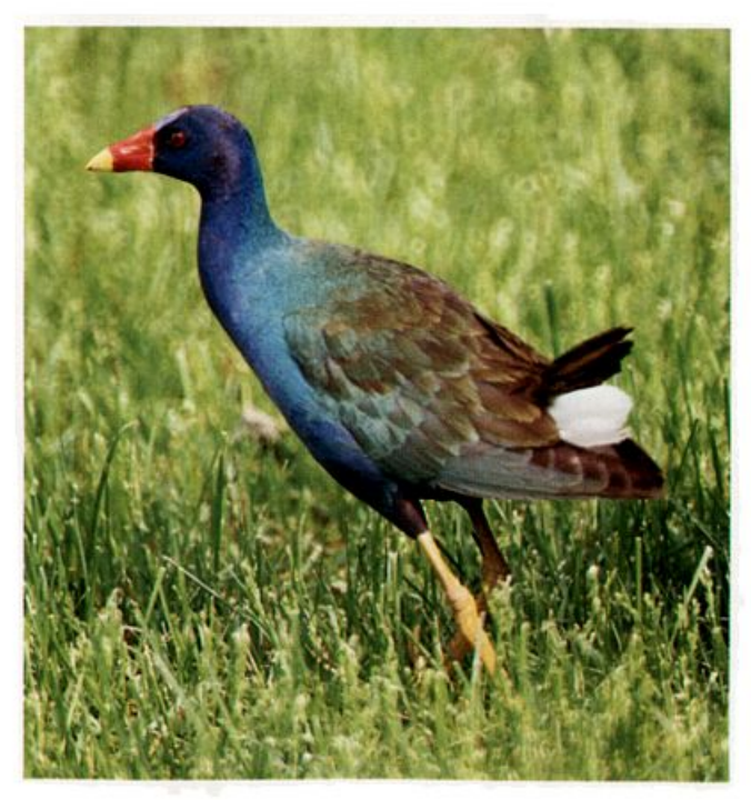
Adult Purple Gallinule at Columbus, Ohio, May 19, 1988.