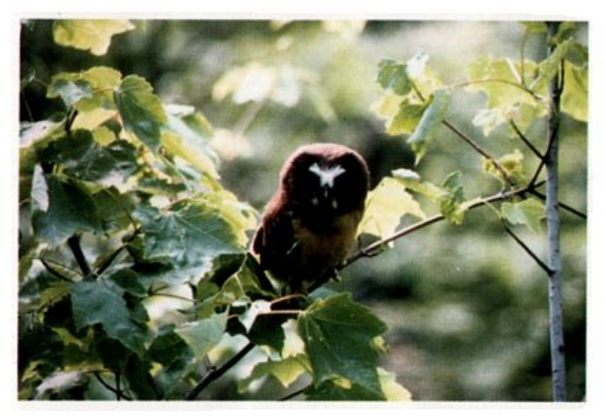
Juvenile Northern Saw-whet Owl in Claiborne County, Tennessee, May 11, 1988.