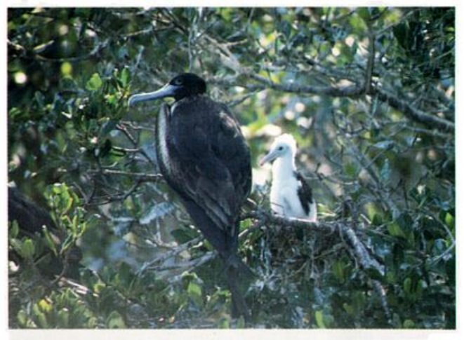
Magnificent Frigatebird with nestling on Long Key, Dry Tortu gas, April 29, 1988. The species nested at the Tortugas for the first time this year.