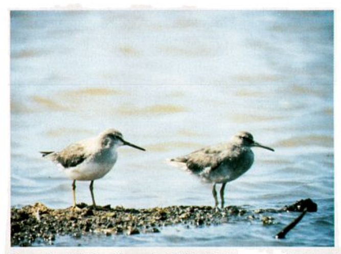
Gray-tailed Tattler (the paler bird) with Wandering Tattler at James Campbell National Wildlife Refuge, Hawaii, April 19, 1988. First record of Gray-tailed for the main Hawaiian Islands.