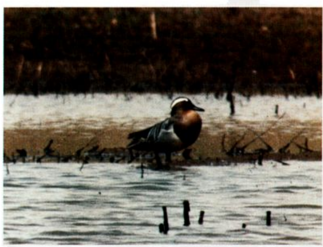
Male Garganey at Buenos Aires National Wildlife Refuge, Arizona, April 10, 1988. First Arizona record.