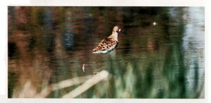
Female Ruff near Joliet, Illinois, April 29, 1988. First record for Will County.