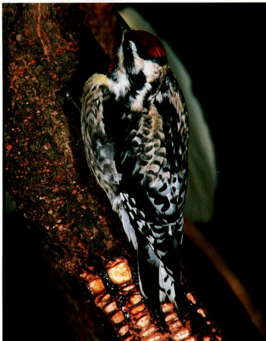
Male Yellow-bellied Sapsucker, showing classic nape and back patterns. Photo/J.R. Woodward. VIREO (w04/7/068)