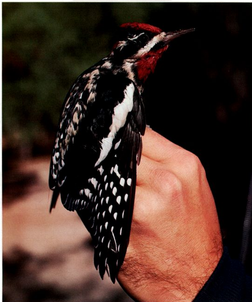
Male Red-naped Sapsucker captured for banding. The extensive red on the throat is typical.