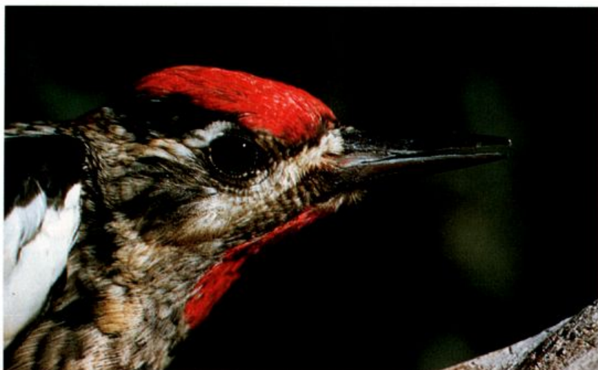
Red-naped Sapsucker. On this freshly-molted bird, some of the black on the face is obscured by pale feather tips. The throat is mostly red, but the white on the chin suggests that this bird is probably a female; notice that no red is visible on the nape at this angle.

red may extend up almost to the bill, leaving just a spot of white on the chin. Superficially these females appear to have the male's throat pattern, except that the red does not spread as far out to the sides or down onto the chest; in these cases, without a careful study, a female Red-naped might be mistaken for a male Yellow-bellied Sapsucker.