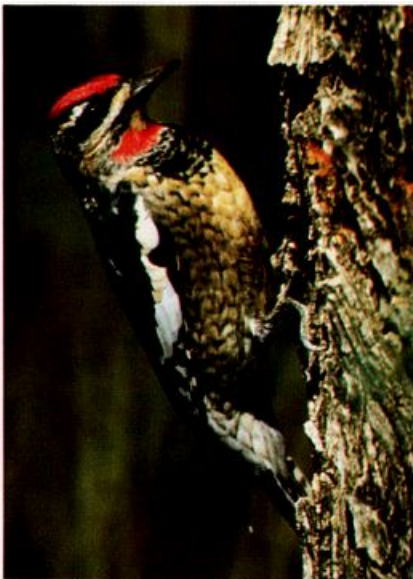
Female Red-naped Sapsucker, with typical throat pattern.

ern member of this pair being called "Red-naped," many birders have assumed that nape color was the major field mark for separating the sapsuckers. Unfortunately, it is not reliable by itself. Red-naped Sapsucker sometimes doesn't have red on the nape—this is especially frequent in females, and especially in summer, when their plumage is rather worn. More disturbingly, Yellow-bellied Sapsucker sometimes does have a little red on its mostly white nape. So to identify these birds with confidence, we have to look at other field marks as well.