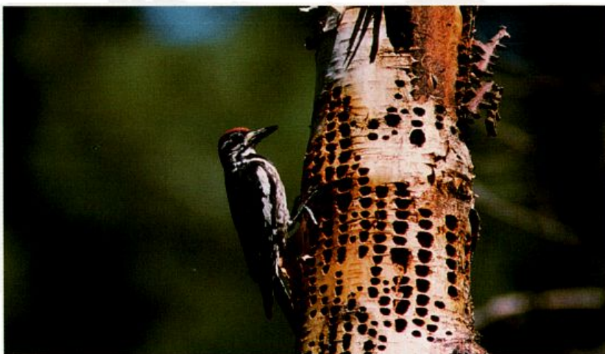
Female Yellow-bellied Sapsucker, with all-white throat. Its back is in shadow, hiding the typical pale spangling there.