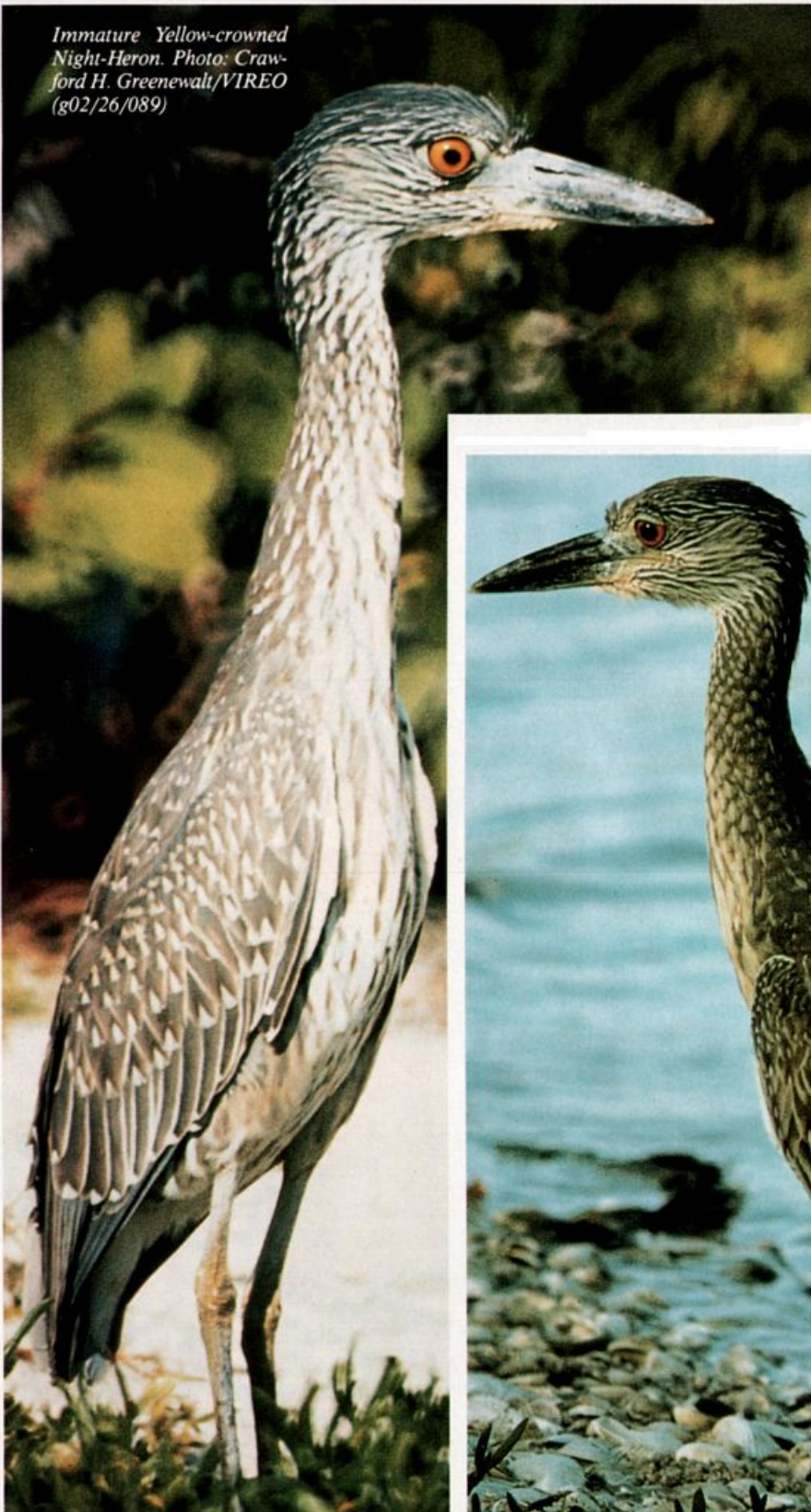
Immature Yellow-crowned Night-Heron. Photo: Craw- ford H. Greenewalt/VIREO (g02/26/089)

momentary posture. But the Yellow-crowned often looks slimmer and more elongated than the Black-crowned, with a longer and thinner neck. This effect is accentuated by its longer legs. For observers mystified by a young night-heron, one recourse is to flush the bird and look for the length of the legs and feet in flight: in Black-crowned, only the toes extend beyond the tail, while in Yellow-crowned the feet are entirely beyond the tail with a bit of the legs showing as well. But with practice, it is also possible to make an accurate judgment of the different leg lengths of the two species when they are standing alone.