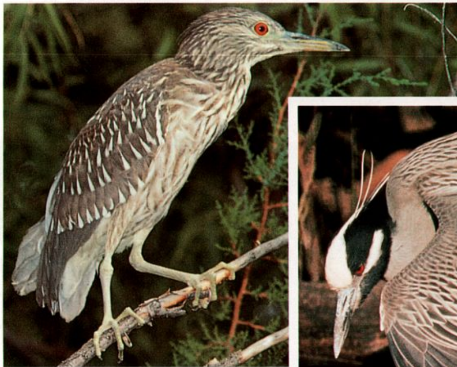
Immature Black-crowned Night-Heron