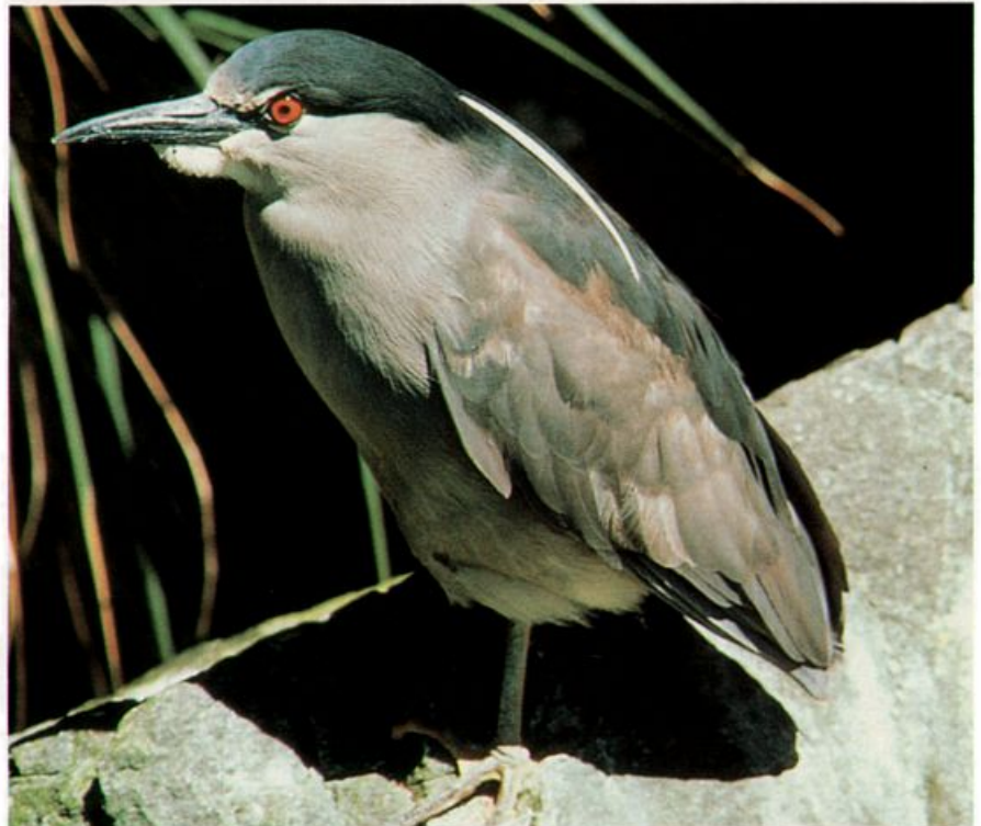
Adult Black-crowned Night-Heron. Photo: Dan Roby/VIREO (r05/2/108)

The Black-crowned Night-Heron ( Nycticorax nycticorax ) is among our most widespread herons in North America (and elsewhere in the world). By contrast, the Yellow-crowned Night-Heron ( Nycticorax violaceus ) has more tropical tendencies. It outnumbers the Black-crowned in parts of the south-