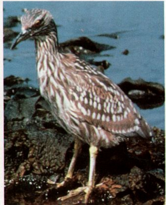
Immature Black-crowned Night-Heron. (p03/10/186)