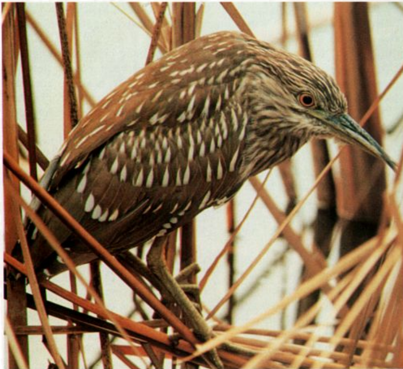
Immature Black-crowned Night-Heron. (w04/7/001)