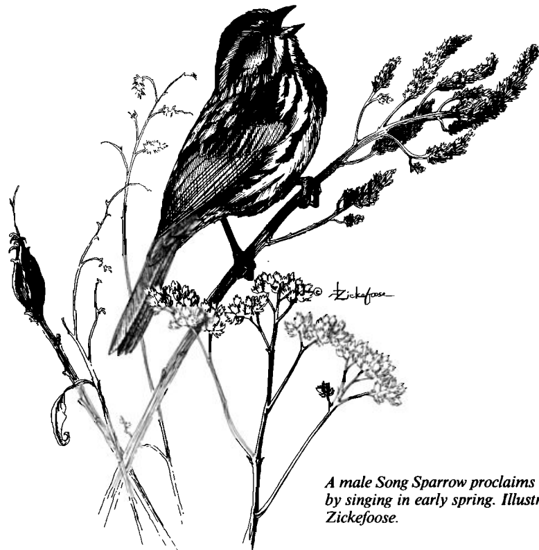
A male Song Sparrow proclaims its territory by singing in early spring.

Nice's work had confirmed most of Howard's conclusions about the nature of territories, but the banding technique allowed her to discover much more. She had followed the life histories of individual birds and their offspring for so many years that she could delineate the boundaries of territories not only in space, but also through time. The maps of territory boundaries, and the particular males and females that occupied each territory, can be compared through several succeeding years, providing a detailed chronicle of the history of one population of Song Sparrows.