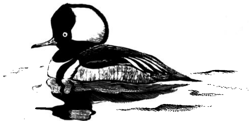
Hooded Merganser (Lophodytes cucullatus).