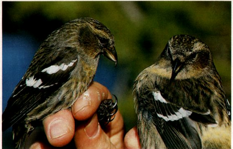
White-winged Crossbills are occasional visitors to southern Ontario.

LAMBERT, A. 1981. Assessment of effects of winter navigation on bird populations on the Great Lakes. Final Report—Contract 14-16-0009-80-003 for the U.S. Fish