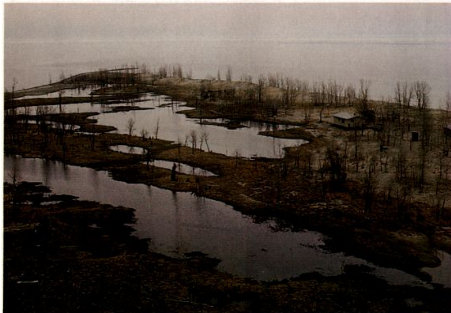
Most of the Observatory's migration work has been done on the eastern end of the Long Point peninsula.

Projecting 30 kilometers into Lake Erie, Long Point is a major stopover point for migrating passerines as well as a staging area for migrating waterfowl. Birds are not the only feature of the peninsula. Foraging and spawning grounds for many fish species, including three considered rare or endangered in Canada, are provided in the shore and marsh areas. Long Point's herpetological fauna is also a major attraction for researchers