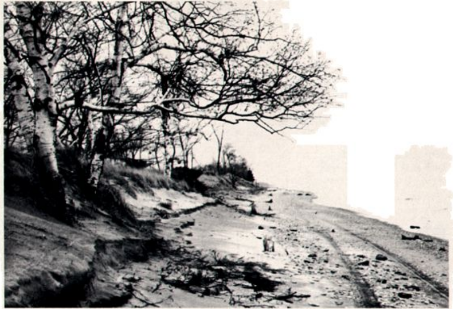
A view of one of Long Point's beaches.

Habitat ranges from dunes with scattered cottonwoods along the shoreline, to marshes and wooded wetlands, to sugar maple and red oak forests. This varied habitat is matched by an equally diverse population of birds. Over one hundred species have been recorded nesting on Long Point, including two species that