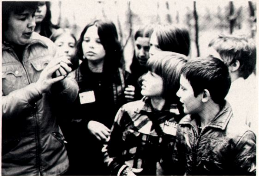
Many school groups visit the Observatory. Here (seen through a mist net), children learn about banding.

The recovery rate of leg bands for small species has traditionally been very low. In 1984, suspecting that people who found banded birds were not opening the band to look for an address, LPBO began adding a second band with the address on