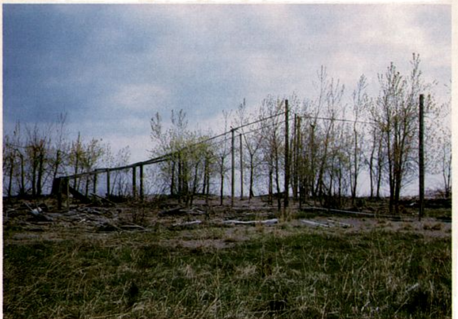
Long Point's sparse vegetation and concentrations of migrants makes this Heligoland trap a practical one. Two or more people walk towards the open end of the funnel to drive birds in and they are caught in a glass fronted catching box at the narrow end. It normally garners 5-20 birds in a drive.

donation in support of a particular species results in a banded individual of that species becoming the donor's sponsored bird. The donor receives all of the banding information on that individual bird: age, sex, measurements, and details of the banding. If and when the bird is re-trapped or recovered, the donor receives full details of that event.