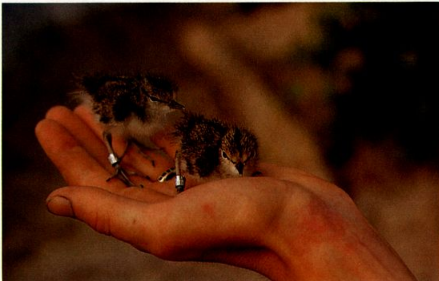
Spotted Sandpiper chicks in the hand.

This five-year project, (1981-1985), was aimed at determining the distribution of every breeding species in Ontario. Co-sponsored by the Federation of Ontario Naturalists, the project attracted 1500 volunteers, including many visitors from the United States. The atlas results are being compiled into a book, scheduled for publication in 1987, which should prove a landmark reference for both research and conservation purposes.