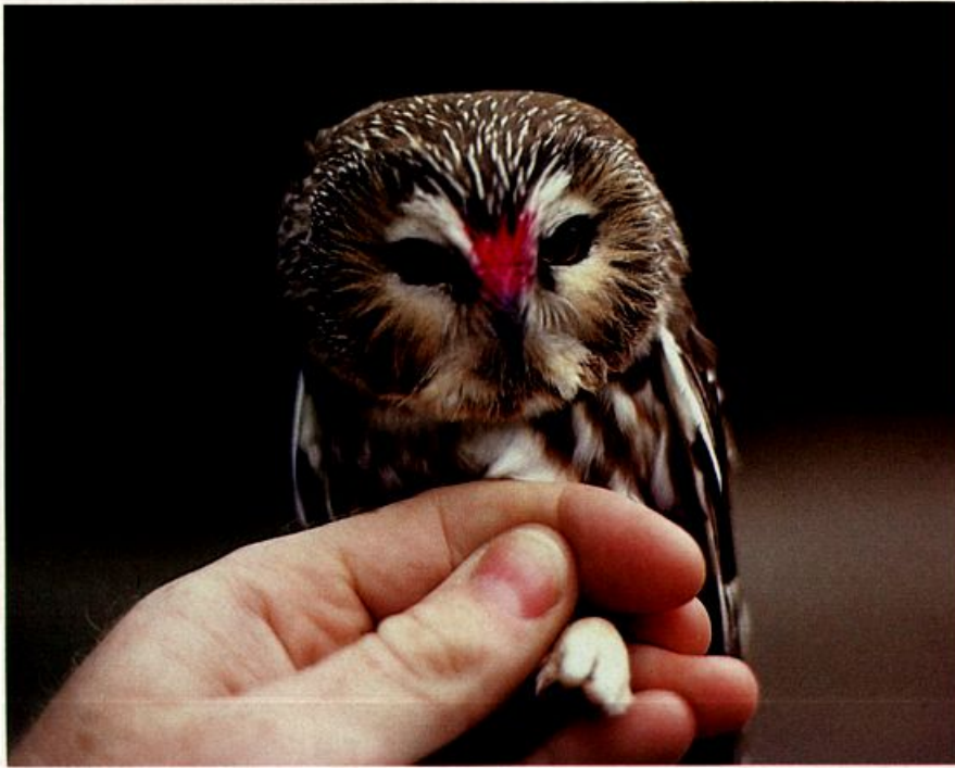
Some Northern Saw-whet Owls were color-marked with different colors for each banding station so they could be identified at daytime roosts.