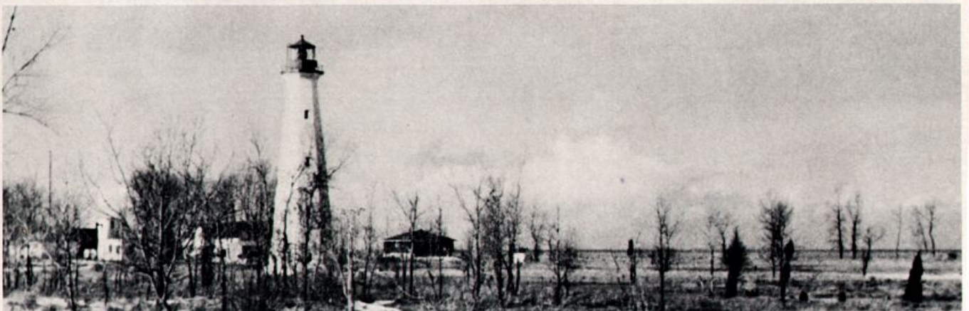
A view from the lighthouse shows open dune habitat and the old field station building that was destroyed by fire in 1973. The new station, built in 1971, was lost in a storm in 1985, in which 50 feet of protective dune was eroded.