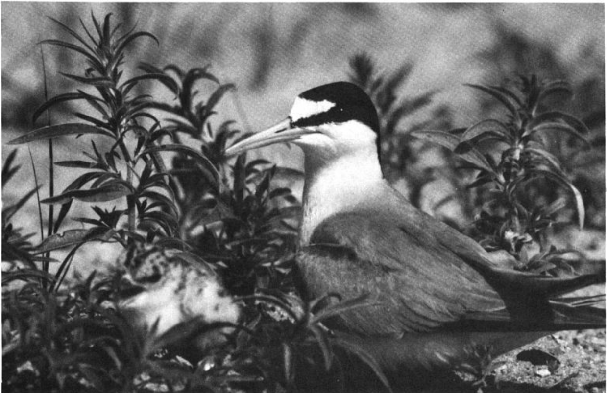
Figure 1. Interior Least Tern at nest. Quivira National Wildlife Refuge, Stafford Co., Kansas, 1982.

viduals in both Kansas and Oklahoma. Our study was initiated to document more precisely the status and habitat availability in Kansas. For three years, beginning in 1980, we attempted to find all nesting Least Terns. The objectives of this study were to locate colonies, census breeding populations, determine breeding chronology and habitat use, evaluate nesting success, and to identify predator