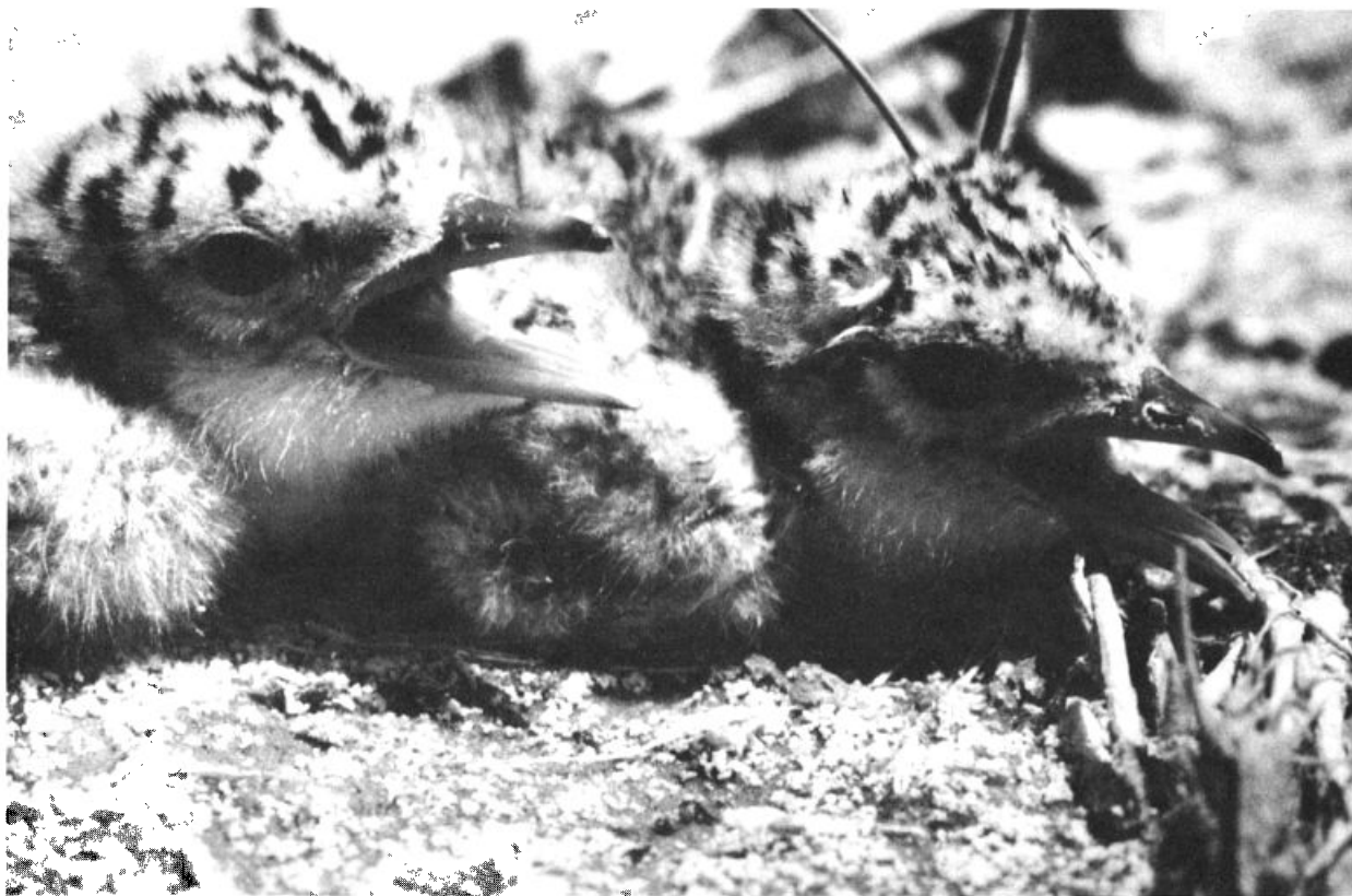
Figure 5. Young Interior Least Terns at nest. Quivira National Wildlife Refuge, Stafford Co., Kansas, 1980.

THE FUTURE of the Least Tern in Kansas depends on the preservation of its habitat. Human manipulation and natural