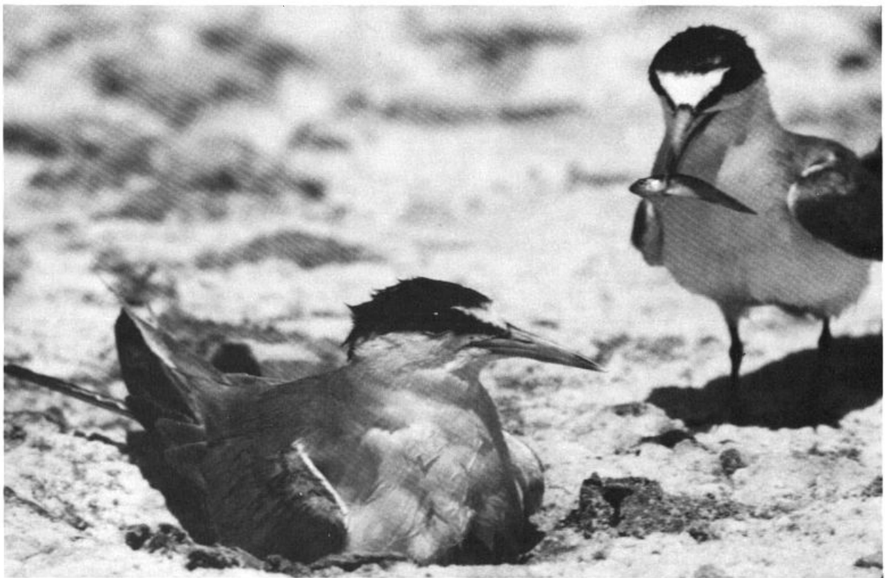
Figure 4. Pair of Interior Least Terns at nest. Meade Co., Kansas, 1980.

predation at still-active nests increased. Burger and Lesser (1979) found increased predation in Common Tern ( Sterna hirundo ) colonies that had been partially destroyed by flooding, and suggested that sufficient numbers of protective adults must be maintained for successful mobbing of predators. The few remaining terns in a partially destroyed colony did not attempt to chase Frank-