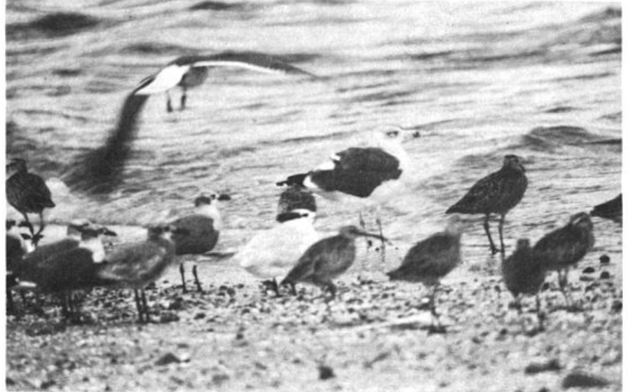
Lesser Black-backed Gull, Ft. Amador, Panama, Dec. 31, 1980. The original color slide clearly shows yellow legs and clear yellow eye.

When first discovered by Sharf in 1979 the bird was in adult basic (winter) plumage. The evidence that all observations were of the same birds is: the gull possesses a peculiar dark mark near the tip of the upper mandible (possibly visible in the photograph) which is not a species characteristic and suggestive of an injury of some type. The bird also sat on the same area of beach at Ft. Amador, often alone, when most of the sightings were made between 1979 and 1982. The latest date before disappearing until the following December was April 12, 1981 (author). At that time it was curiously in the same plumage that it possessed in December including the typical "winter head streaking" of L. fuscus . It was initially identified as a