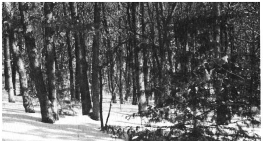
Winter Bird-Population Study 14, Oak-Hickory Forest, I.

14. OAK-HICKORY FOREST, I. — Location: Kansas; Douglas Co., on the Univ. of Kansas Wall Biological Reserve. Predominantly on NW 1/4, SW 1/4, Sec. 28, T14S, R20E, 38°48'N, 95°12'W, Baldwin City Quadrangle, USGS. Continuity: Established 1979, 3 years. Size: 8.1 ha = 20 acres. Coverage: Jan. 6, 11, 14, 19, 27; Feb. 15; Mar. 1. Total 7 trips, 0900-1530, averaging 45 min. Count: Downy Woodpecker, 3 (37, 15); Red-bellied Woodpecker, 2 (25, 10); Red-headed Woodpecker, 2; Black-capped Chickadee, 2, White-breasted Nuthatch, 2; Com. Crow, 1 (12, 5); Tufted Titmouse, 1; Dark-eyed Junco, 1; Great Horned Owl, +; Com. Flicker, +; Blue Jay, +; Brown Creeper, +, E. Bluebird, +. Average Total: 14 birds (173/km 2 , 70/100 acres). Remarks: Total species, 13. Only the Downy Woodpecker was seen on every trip.