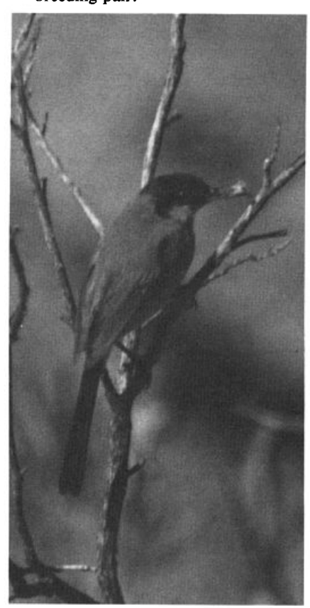
Black-capped Gnatcatcher, Chino Canyon, Ariz., May 18, 1981.