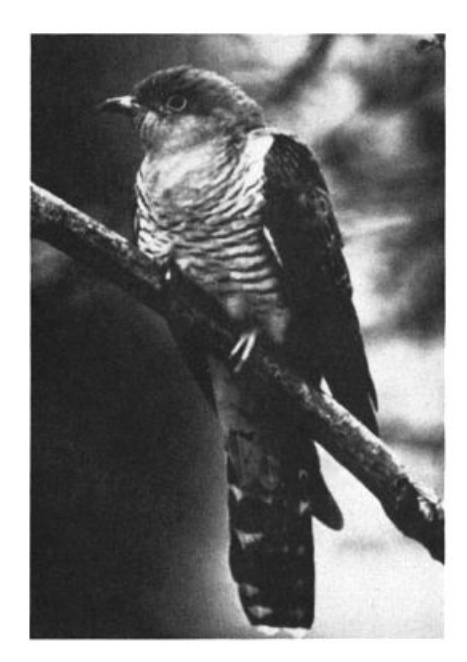
Common Cuckoo, Martha's Vineyard, Mass., May 4, 1981.

friendly Whip-poor-will slept the night of April 12 on a bed in an apartment of its own choosing in Louisville, Kentucky.