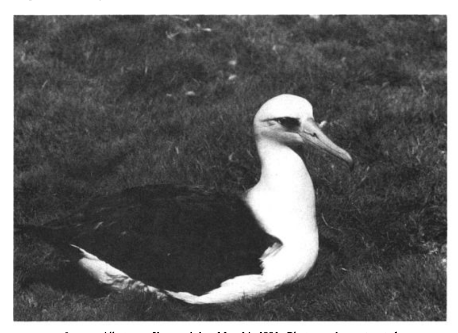
Laysan Albatross, Yuma, Ariz., May 14, 1981.

Solander (Providence) Petrel Pterodroma solandri, or melanopus, also called Bird of Providence, is a gadflypetrel that breeds on Lord Howe Island, east of Australia. It has been recorded as far north as Japan, and possibly Hawaii. The report of a shipboard sighting west of mid-California is fascinating—and if confirmed, would add another species to the ever-growing list of pelagics that visit North American waters.