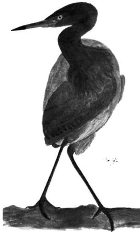
Little Blue Heron, Florida caerulea .

There are only three definite records published for this species in Sonora. All records are from April: April 21, 1930 (van Rossem 1945), April 22, 1966 and April 23, 1974 (Russell and Lamm 1978). Those sightings were at San Pedro