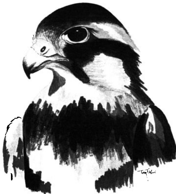
Aplomado Falcon, Falco femoralis .