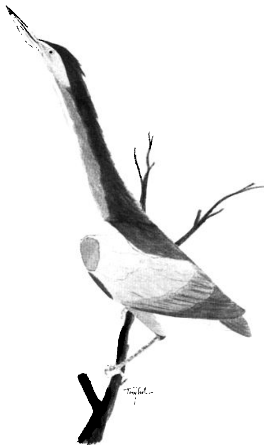
Least Bittern, Ixobrychus exilis .

along permanent streams but absence from the northwestern desert. Two were seen soaring over the Rio Magdalena, July 28, 1979, just south of Caborca. Because the area appeared, at best, marginal for the nesting of this species, these birds may have been migrants.