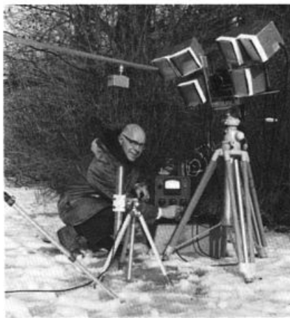
Equipment used by the author. In spite of the formidable array of apparatus, many birds quickly accept its presence at feeders, nesting cavities and burrows.

It seemed appropriate to carry out the project in two phases, with the flash units and light-triggering system making up the first phase. Typical commercial flashes have a light duration on the order of 1000 microseconds (1000 millionths or 1 thousandth of a second) which is too lengthy to produce a sharp photograph without any blur. Edgerton described a flash circuit with a flash duration in the order of 60 microseconds. Since this was sufficiently brief for what I felt necessary, I constructed a bank of six photo flash units using Edgerton's circuits. The flashes were used with my Nikon F2 and Nikon FTn cameras, and with this equipment I found hummingbirds comparatively easy to photograph, because they hovered near, or at the feeder.