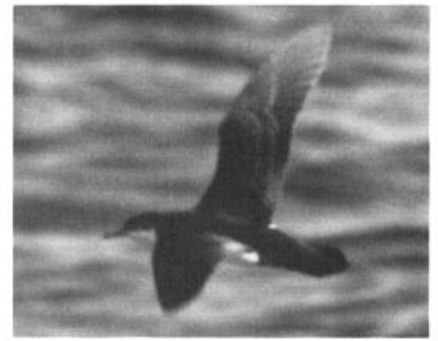
Audubon's Shearwater , Gulf Stream, N.C., Sept. 4, 1977.

Wilson's Storm-Petrel, Oceanites oceanicus . This is certainly the most common pelagic summer resident in North Carolina waters. We encountered these birds on 53 of 56 trips from April 17* through October 12*, although they became increasingly uncommon after mid-September. Published records range from March 8, 1974 (Chat 38:78) through October 22 (A.B. 27:40). These birds are quickly attracted to chum, and during the season of occurrence we could always attract 10 to 50 within minutes, even when no birds had been sighted for several hours. Conservative estimates varied from 50 to 200 individuals seen on trips made during the warmer months. On a two-day trip on May 17-18, 1978 we counted over 1000 migrating individuals. During the spring period individuals are often seen inshore and on occasion from the beach.