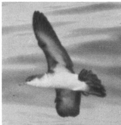
Audubon's Shearwater (Puffinus lherminieri) , Gulf Stream, 16 mi e. of Cape Hatteras, N.C., Aug. 1, 1977.

Audubon's Shearwater, Puffinus lherminieri . Our observations indicate that small "black-and-white" shearwaters, nearly all of which prove to be Audubon's, occur in North Carolina waters more or less continuously from April 23 through November 7, although their abundance fluctuates greatly. We found these birds to be common-to-abundant mid-May to early June and throughout the fall. On calm days small flocks are sometimes seen swimming and feeding among mats of Sargassum . During the summer we typically saw only one or two individuals per offshore trip, but on several trips hundreds were present.