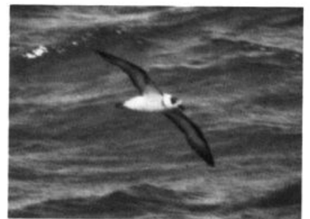
Black-capped Petrel, (Pterodroma hasitata), 18 mi s. of Cape Hatteras, N.C., May 21, 1977.