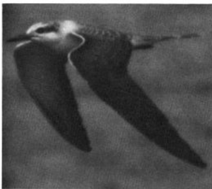
Bridled Tern ( Sterna anaethetus ), Gulf Stream, N.C., Sept. 3, 1977.

Sooty Tern, Sterna fuscata . Most of the literature records for this species along the Atlantic seaboard are storm wrecks, although there are a few recent sightings that do not appear to be the result of adverse weather systems. We observed two of these terns on June 1 and two again on September 23, 1977. Excluding one March 16, 1869 record (B.N.C.), these dates appear to bracket the entire period of occurrence for North Carolina. This tern is usually seen singly or in twos and is much less common than the preceding species. There are only 21 records for North Carolina, at least nine of which are associated with tropical storms. Several of the remaining North Carolina records are of individual terns observed in tern colonies, and on June 16, 1978 John Fussell et al. , found evidence of one nesting attempt, details of which will be reported elsewhere.