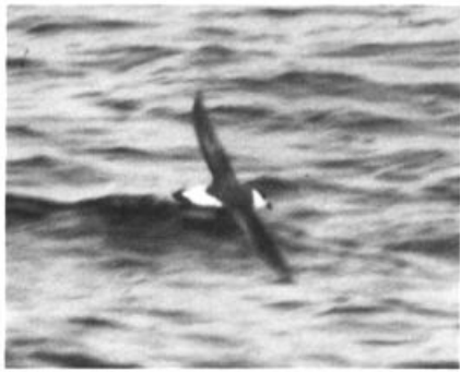
Black-capped Petrel , 45 mi e. of Cape Canaveral, FL, Feb. 2, 1977.

of occurrence in spring and fall. Sight records or photographs are available for February (3 individuals), April (10), May (24), June (2), July (1), August (8), September (4), October (25-45), and November (3). Nearly all sightings have been along the edge of the Gulf Stream, although several have been along the edge of the continental slope on days the Gulf Stream was farther to the east than normal.