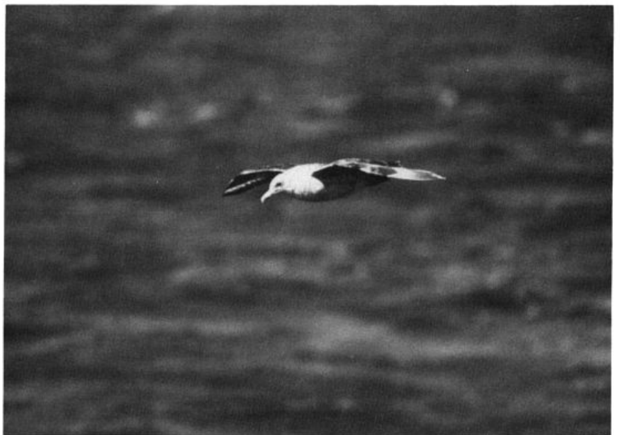
South Polar Skua (Catharacta macconnicki), Gulf Stream, 18 mi. s. of Cape Hatteras, N.C., May 21, 1977.

(Great) Skua, Catharacta skua . There is a single documented record of this species from the state. A banded individual was found dead on the beach at Cape Lookout on December 29, 1975. The bird had been banded five months previously in Iceland (Lee and Rowlett 1979).