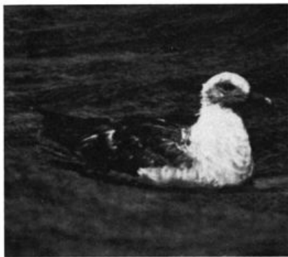
South Polar Skua, 18 mi s. of Cape Hatteras, N.C., May 21, 1977.