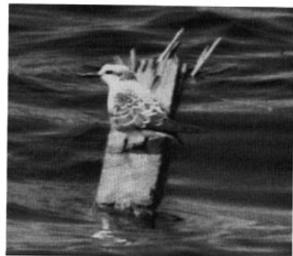
Bridled Tern, 25 mi s.s.e. Cape Hatteras, N.C., Aug. 20, 1978.

Other species which we observed regularly 20 or more miles offshore were: Ring-billed Gull, Larus delawarensis ; Herring Gull, L. argentatus ; Great Black-backed Gull, L. marinus (mostly immatures); Laughing Gull, L. atricilla ; Black Tern, Chlidonias niger ; Caspian Tern, Sterna [Hydroprogne] caspia ; Common Tern, S. hirundo ; and Royal Tern, S. maxima [Thalasseus maximus] . Sandwich Terns, S. [Thalasseus] sandvicensis , were commonly encountered, but normally fed 6-12 miles from the beach. Our few records of Glaucous Gull, L. hyperboreus , are from inshore, and there is one sight report of an Iceland Gull, L. glaucooides , from 90 miles off the North Carolina coast (Helmuth 1920). The presence of thousands of foraging Bonaparte's Gulls, L. philadelphia , 20-34 miles out of Oregon Inlet on December 29, 1977 and moderate numbers on November 14, and December 30, 1978, suggest that it may regularly