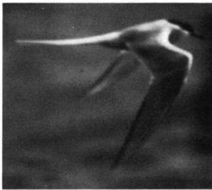
Arctic Tern ( Sterna paradisaea ), Gulf Stream 29 km s. of Cape Hatteras, N.C., May 21, 1977.