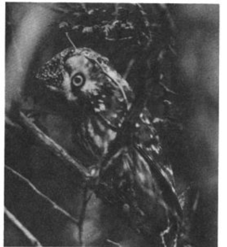
Boreal Owl on Amherst Island.