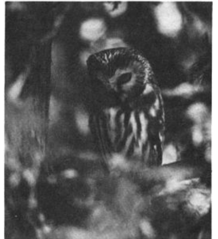
Saw-whet Owl on Amherst Island.