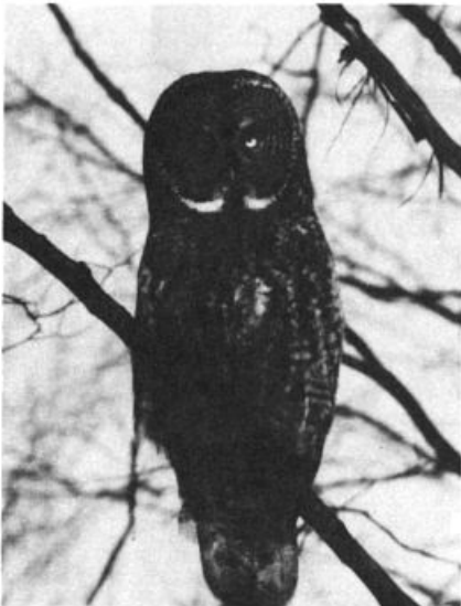
Great Gray Owl on Amherst Island.