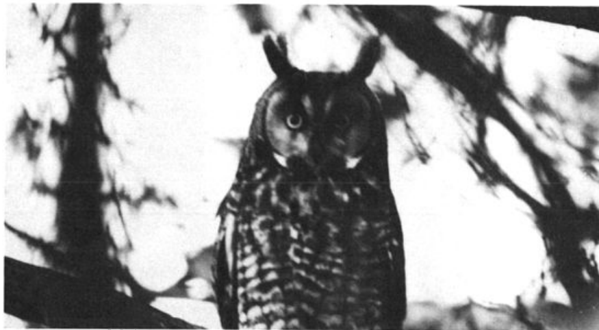
Long-eared Owl on Amherst Island.

Such opportunistic response to super-abundant, patchy food sources seems to be a common strategy in many predatory animals (Bell, 1979). The great mobility of raptors makes local, temporary incursions possible (Galushin, 1976).