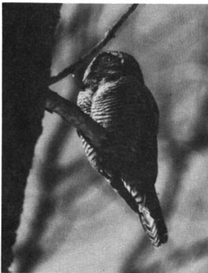
Hawk Owl on Amherst Island.

A LTHOUGH NORTHERN OWLS moved into eastern North America in large numbers in the winter of 1978-79, the invasion of owls in the Kingston, Ontario, Canada area was unique. Over the course of the winter, thousands of bird-watchers from across Canada and the United States visited Amherst Island, 3 miles southwest of Kingston, to view an unusual assemblage of owl species.