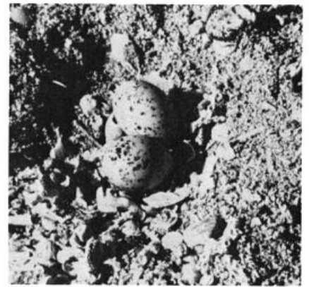
Fig. 3. Two-egg clutch of the Royal Tern inside nest.

This appears to be the first record of a nesting colony of the Royal Tern on mainland Puerto Rico. Biaggi (1970) could not place this species of bird as migratory or resident for Puerto Rico because nesting habits on Puerto Rico were not previously reported. On the other hand, this species has been reported to nest on some small islands surrounding Puerto Rico. McCandless (1958) mentioned nesting of the Royal Tern on Mona Island. P. A. Buckley (personal communication) informed me