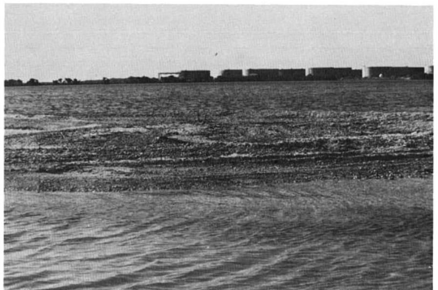
Fig. 2. Sandbar where nests were observed, surrounded by shallow bed of seagrass. The sandbar undergoes structural changes during high wave periods.