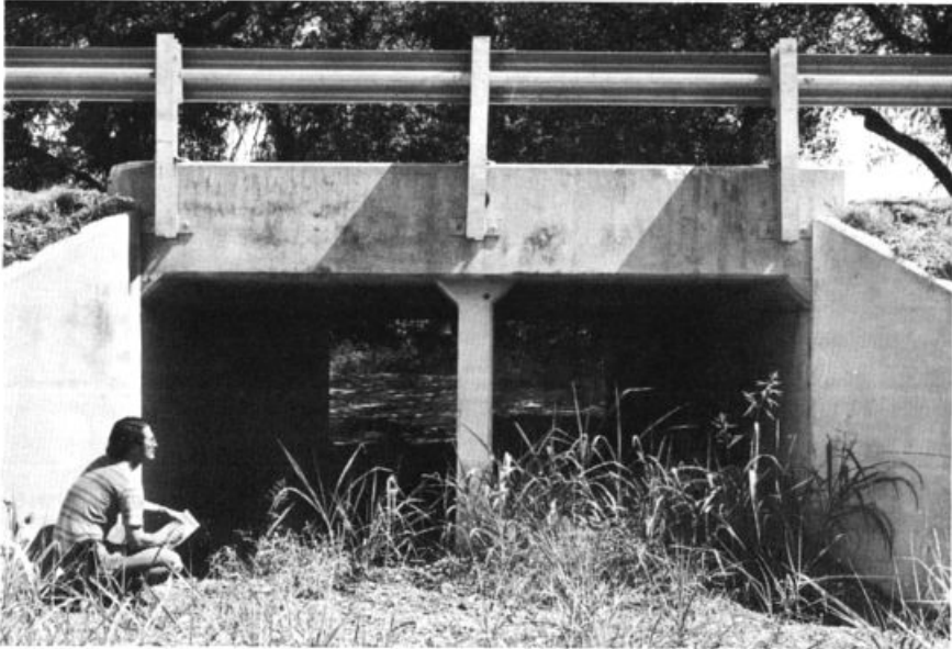
Figure 2. Culvert 8. Several nests containing P. fulva x H. rustica hybrids have been found at this site.

data; however, circumstances occasionally dictate visits at less opportune times. Most locality records reported here are based on morphologically identified nestlings; several on presence of scolding adults at culverts containing typical nests with incubated eggs or very young nestlings; a few, on the presence of typical nests only.