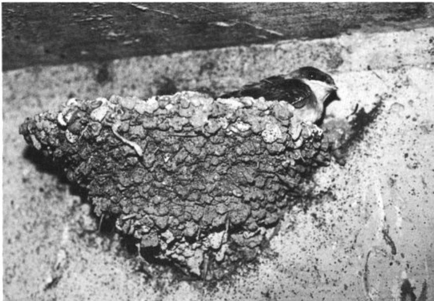
Figure 4. Nestling Cave Swallow at nest in Culvert 27, Uvalde Co., Texas.