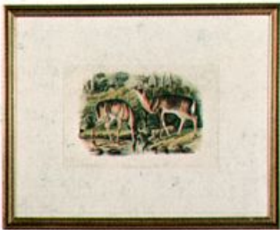
The Quadrapeds of North America (1854)