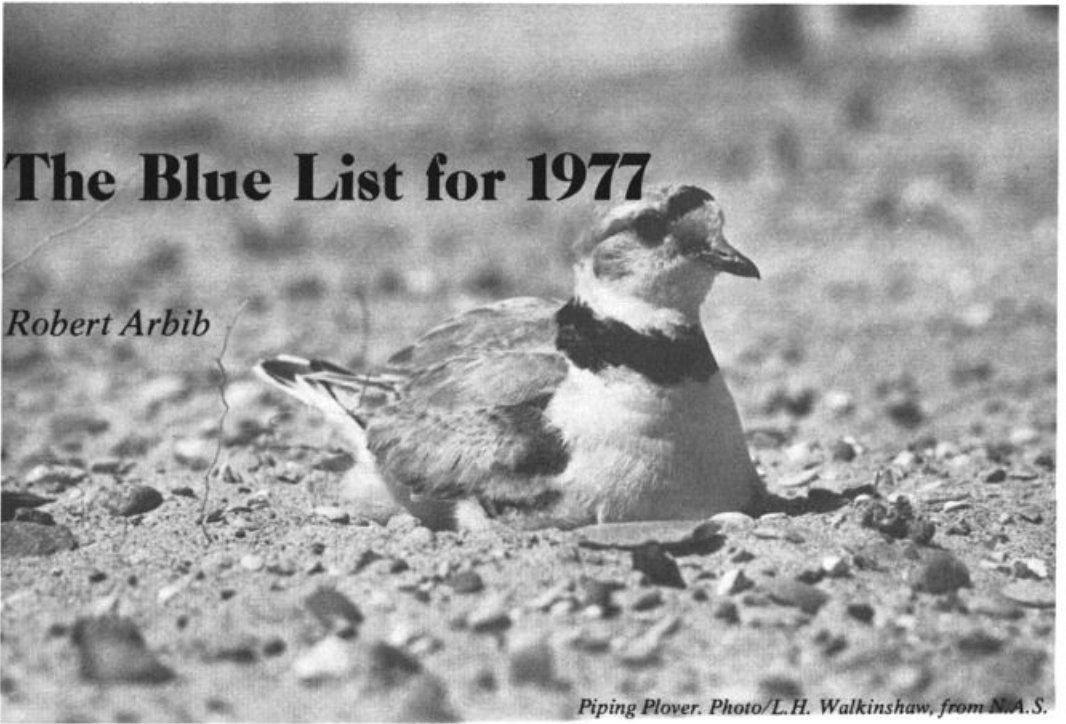
Piping Plover.

When the Blue List was inaugurated six years ago ( American Birds 25:948, 1971), we wrote "With this issue we inaugurate the maintenance of a list of North American bird species which are of especial concern, and of which observers are asked to take particular note. The species named to this list are ones which have recently or are currently giving indications of non-cyclical population declines or range contractions, either locally or widespread.