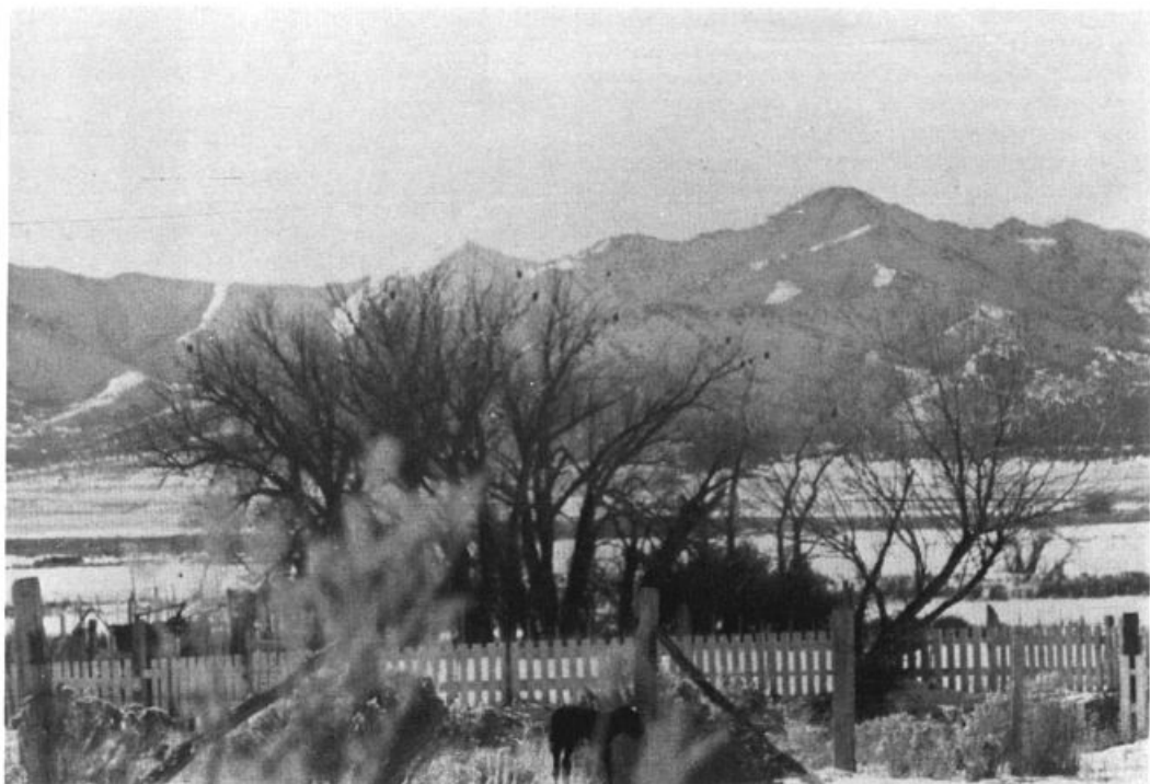
Rush Valley Roost. 15 + Bald Eagles.

perches or telephone poles and also bring food into the roost trees. During one season four hind legs and five skulls of Black-tailed Jackrabbits and one hind leg of a cottontail ( Sylvilagus sp. ) were gathered from the Rush Valley roost site. Cottontails are restricted to rocky or brushy areas around the foothills of the valleys. Their numbers are not significant when compared to the widespread distribution of Black-tailed Jackrabbits.