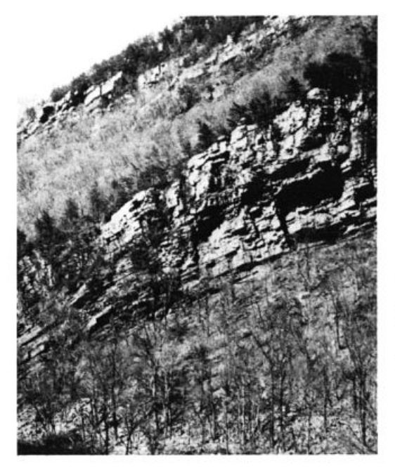
Fig. 2. A 120-foot quartzite cliff. Ravens nested under the overhang right.

In 1972, 40 square miles of mountains with few cliffs northwest of the main study area were searched for tree nests but none were found. Ground searches for tree nests were so inefficient that the results were inconclusive and the area was excluded from the data presented.