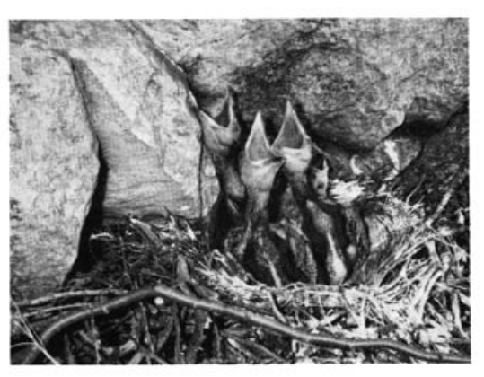
Fig. 3. Nestlings are protected from March weather by rocky projections.

The distance from each active nest to the next closest active nest was measured and a mean distance to the nearest active nest was computed. To determine the boundary of the study area, we used one-half the mean distance to the nearest active nest as a radius from each active and potential nest site. The probability that an undetected active raven nest occurred in the study area was very low.