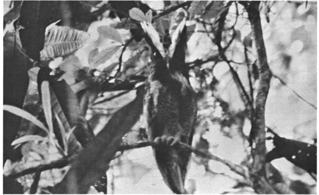
Crested Owl, Lophostrix cristata, on Pipeline Road, May 11, 1974.

The first photograph, taken from a color transparency, is of a Crested Owl, (Lophostrix cristata), photographed by Jaime J. Pujals in undergrowth along the Pipeline Road near Gamboa, C.Z., on May 11, 1974. Shown here, possibly for the first time, is the amazing full extent of the "horns", exaggerated by the broad white superciliary which continues along the inner margin of the ears. None of the extant color illustrations, painted from specimens, show this plumed or long-eared effect. The species, although widely distributed in the American tropics, is little known. The voice is somewhat frog-like.