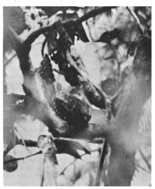
Oilbird, Steatornis caripensis, on Pipeline Road, May 11, 1974.