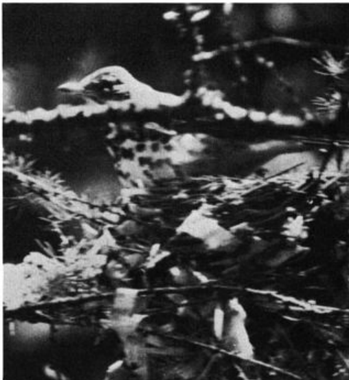
Wood Thrush at nest, Kempt, Queens Co., N.S. June 18, 1973. First provincial breeding record.