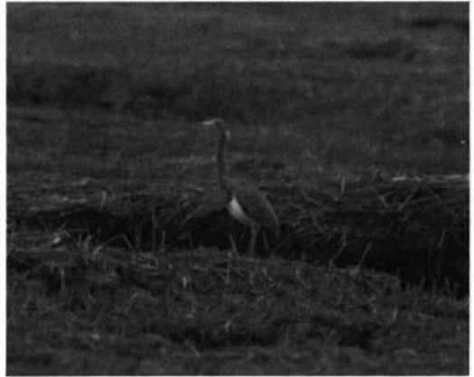
Louisiana Heron, Bayfield, N.B. May 11, 1973.