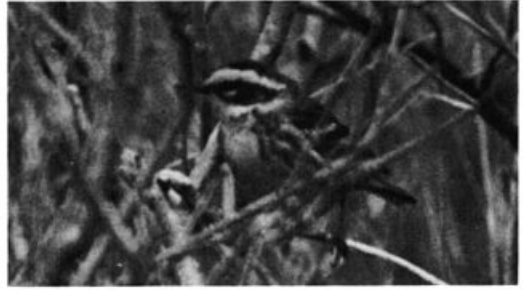
Townsend's Warbler, Sable I., N.S., June 10, 1973. First record for Atlantic Canada.