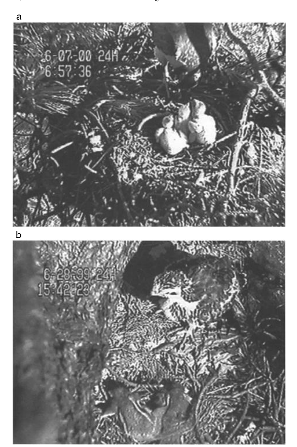
Figure 2. Images of Northern Goshawk nests taken from video footage in east-central Arizona: (a) Female goshawk feeding 5-d-old young. (b) Golden-mantled ground squirrel and plucked Stellar's Jay in the nest with 25–30 d old goshawk young.