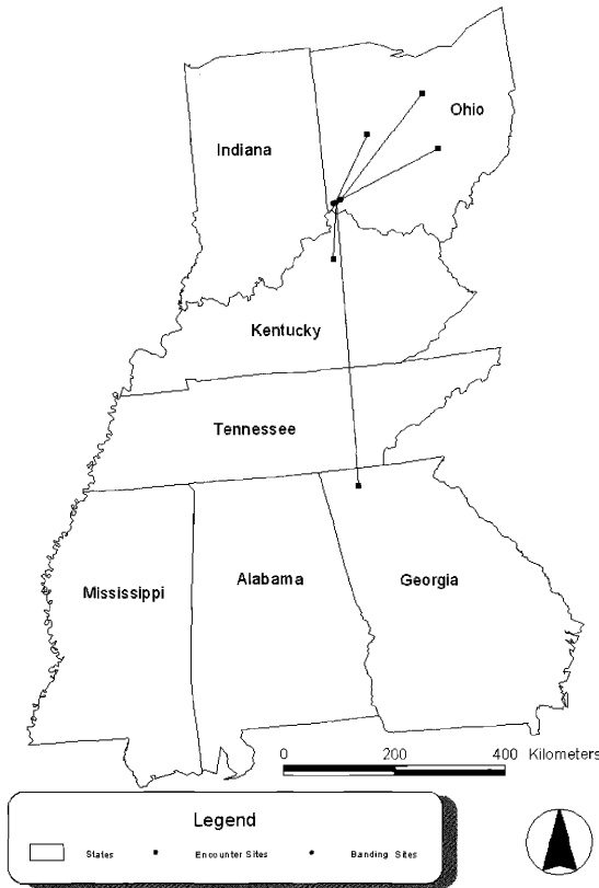
Figure 1. Map of long-distance (>100 km) dispersal of Red-shouldered Hawks banded as nestlings in southwestern OH, 1955–2002. Lines join natal sites and encounter locations. All birds shown were recovered dead and four of the five birds shown were <663-d old at recovery.

Distance from Natal Nest. For SW OHIO birds, mean distance from natal nest at time of encounter was 38.5 \pm 13.6 km (Table 1). Most birds moved <30 km, but five birds were recovered 103–500 km from their natal nest (Fig. 1). CED analysis of distance from natal nest at time of encounter indicated that 50% of SW OHIO Red-shouldered Hawks were found <15 km from their natal nest, 75% were <29 km away, and 95% were <62 km away ( R^2 = 0.98 , \beta = -0.048 , P < 0.001 , N = 43 ; Fig. 2).