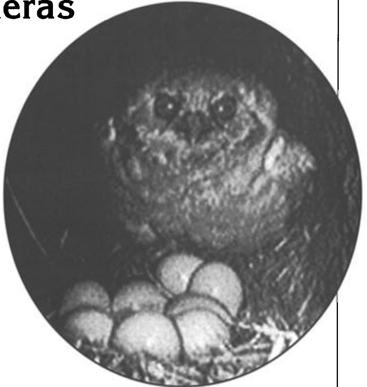
BURROWING OWL WITH EGGS Image captured with the Peeper Video System