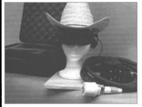
PEEPER VIDEO PROBE Ideal for studying burrowing owls.

Access a variety of nests with this 50-foot elevating video system.