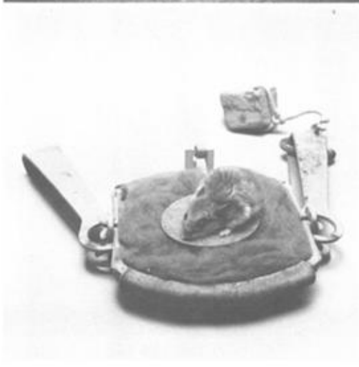
Figure 1. Top: Modified leg-hold trap showing jaw padding and anchor wire around base. Middle: Harness for securing the bait mouse. Bottom: Bait mouse harnessed to the trap and polyester batting.