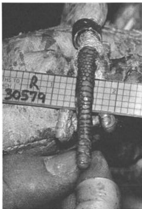
Figure 1. Photograph of the middle toe (#3) of a Peregrine Falcon showing the toe-scale pattern.