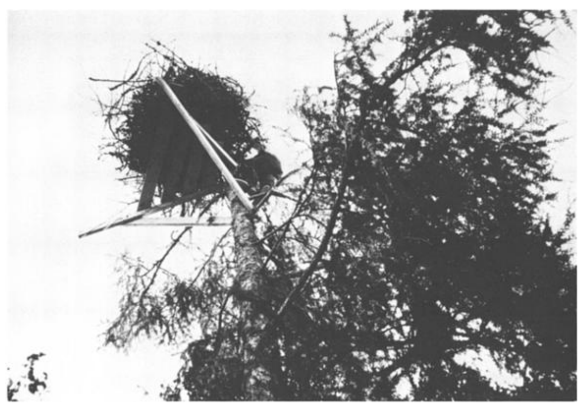
Figure 3. Photograph of Osprey nest platform near Loon Lake, Saskatchewan.