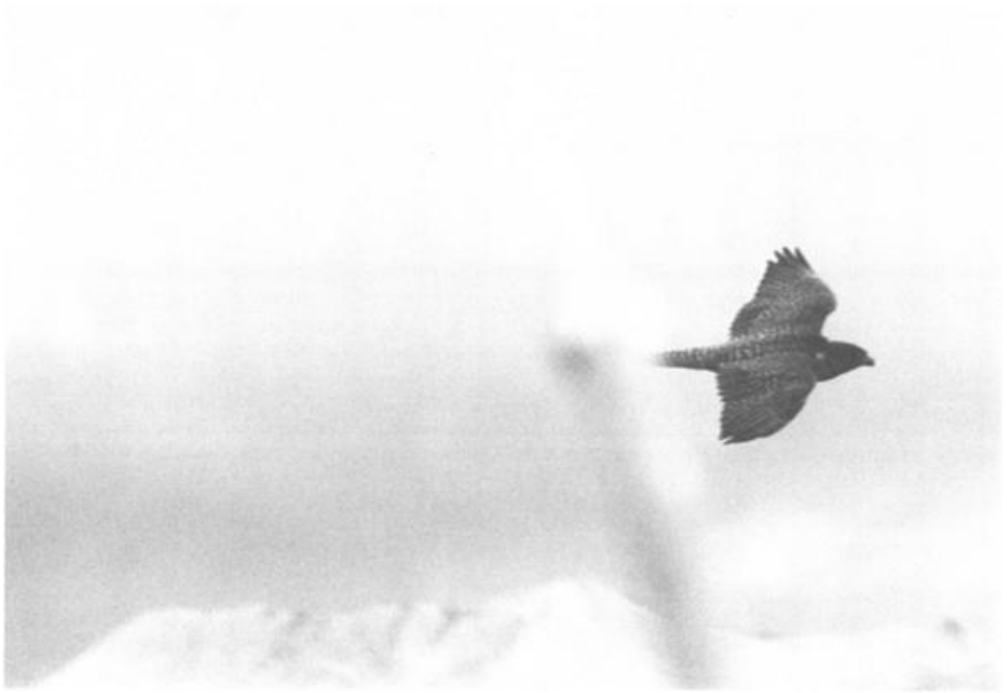
Figure 3. A female Gyrfalcon, being "shadowed" by a helicopter, calmly soared toward and then past within 12–15 m in front of the helicopter. The 2 m antenna on the helicopter's nose shows because the helicopter's slow forward motion was being stopped.

On 11 July the helicopter hovered about 14 m away from the cliff while the female completed an entire sequence of feeding young and then settled to brood without showing apparent distress from the presence of the helicopter. (See White and Sherrod 1973, for a photo from this feeding sequence and further discussion.)