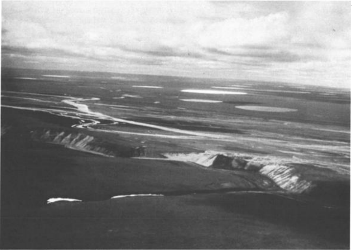
Figure 2. View from near eyrie 2 (see E2, Fig. 1) on 12 June showing the river valley in the midground and wet tussock-heath tundra with numerous lakes in the background.

greatest use (Fig. 2). Fifty-one percent (counting those where we started to follow him but then subsequently lost him) of the hunting forays occurred over this area. Likewise, the greatest amount of time was spent by the male in that area and he went farthest from the eyrie in that direction. West across the river an area of similar habitat but much drier and better drained received the next greatest use. About 36% of the hunting sorties occurred there.