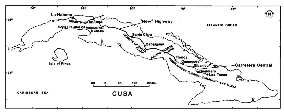
Figure 1. Turkey Vulture survey route along the "New Highway" and Carretera Central in Cuba, and major geographic features along route.

sighted. Flying activity was weighted according to sampling effort because all periods were not sampled equally. General weather conditions (clear, partly cloudy, complete cloud cover, rain; wind conditions) were recorded. Counts were not made during periods of poor visibility.