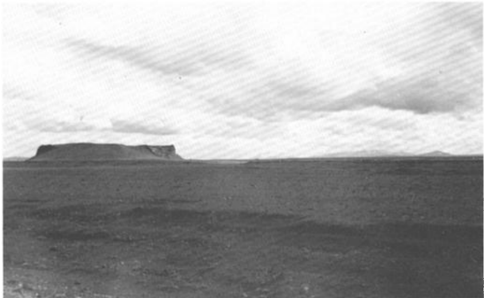
Figure 4. View of Hrossaborg from the road across the Burfellshraun. The Gyrfalcon eyrie is on the opposite side. Note the sparsely vegetated "sandy waste." In the distance are the mountains of the Central Highlands of Iceland. June 1967.