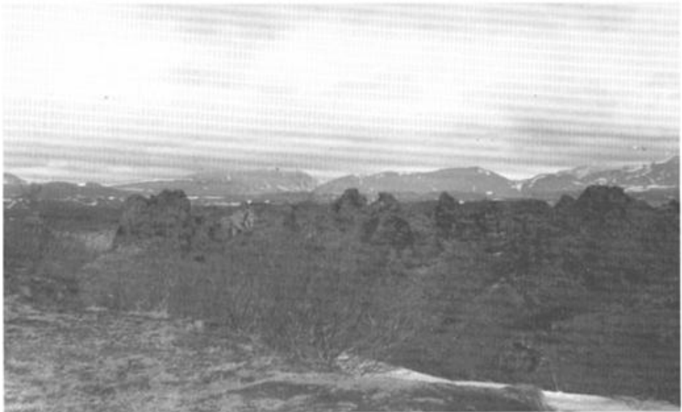
Figure 3. View from the lip of Dimmuborgir into the depression. The photo does not give an adequate idea of the depth or the extensiveness of Dimmuborgir. In the distance some of the hills that form the eastern boundary of the Myvatn basin. In the foreground low bushes of birch ( Betula pubescens ). May 1967.