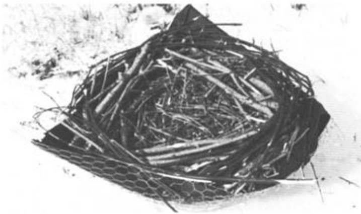
Figure 3. View of artificial nest from above showing nest material.