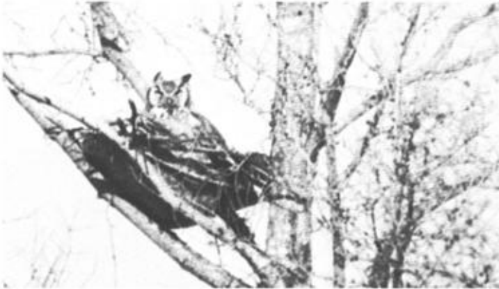
Figure 1. Great Horned Owl in artificial nest in central Minnesota.