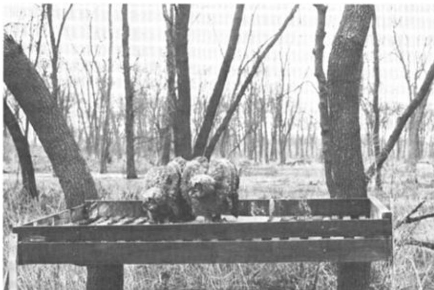
Fig. 2. The platform and the underhanging screen