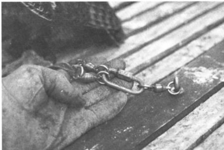
Fig. 5. The three-swivel tethering system with connecting link