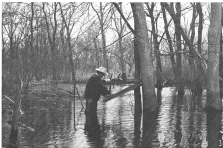
Fig. 3. The retractable underhanging screen catches prey remains and pellets