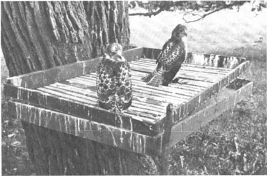
Fig. 4. The platform floor of spaced wooden laths and tether anchoring bases