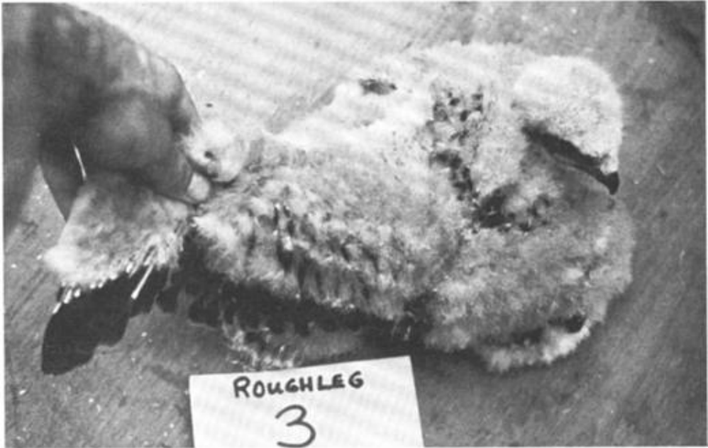
Figure 2. Three-week-old Rough-legged Hawk losing second coat of down as feathers push out of their sheaths.