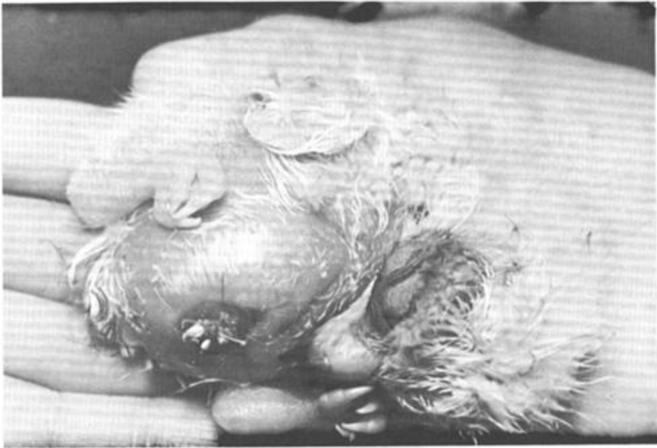
Figure 6. Newly-hatched Golden Eagle chick resulting from artificial insemination. This particular chick was premature (see text). Note sutures in umbilicus.