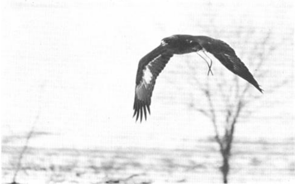
Figure 7. Surviving immature Golden Eagle resulting from 1972 artificial insemination at Cornell University.