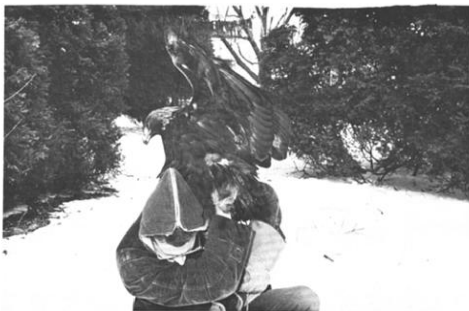
Figure 2. Male Golden Eagle copulating on shoulder.