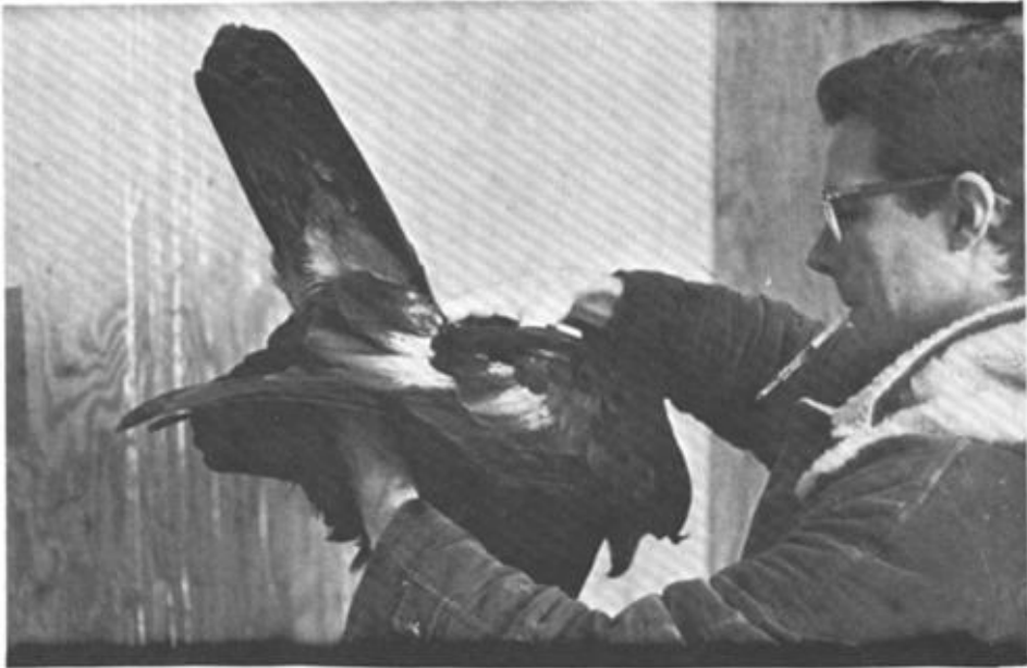
Figure 3. Stimulating female Golden Eagle into copulatory posture prior to cooperative insemination.