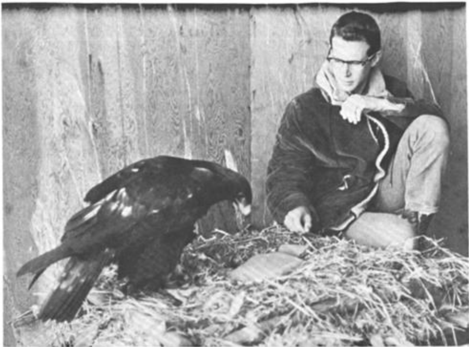
Figure 4. Female Golden Eagle returning to nest to resume incubation. Hot-water bottle is covering egg.