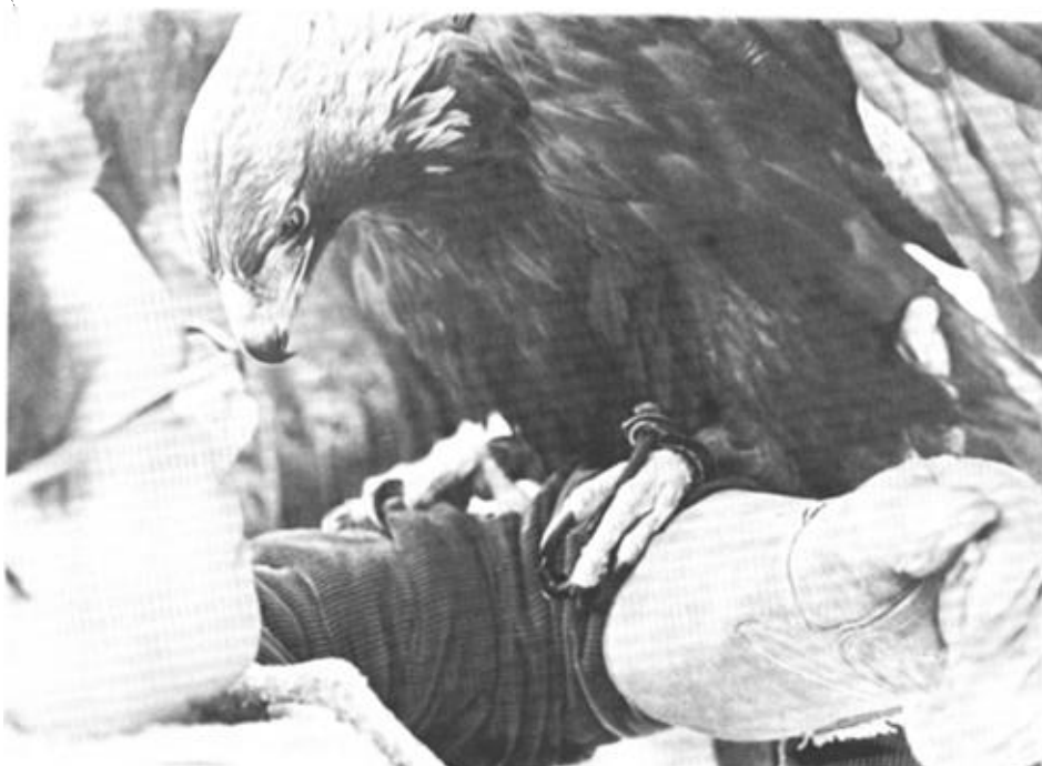
Figure 1. Male Golden Eagle copulating on arm. Note balled feet and Grier's right arm under tail to collect semen.