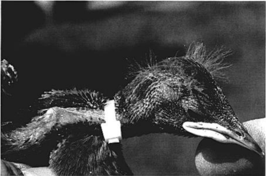
FIGURE 2. Close-up photograph of an electrical cable-tie in place on the throat of a nestling European Starling ( Sturnus vulgaris ).

effectiveness in preventing swallowing of smaller food items by the presence, in the back of the throat, of the avian equivalent of "saliva." Our assumption was that if these fluids could not be swallowed by the nestling, neither could food items. In nearly every instance where a cable-tie was used but no food items were present, these fluids were found in the back of the throat, indicating the cable-tie was properly fastened and functioning. In a majority of the instances with pipe cleaners, however, these fluids were absent.