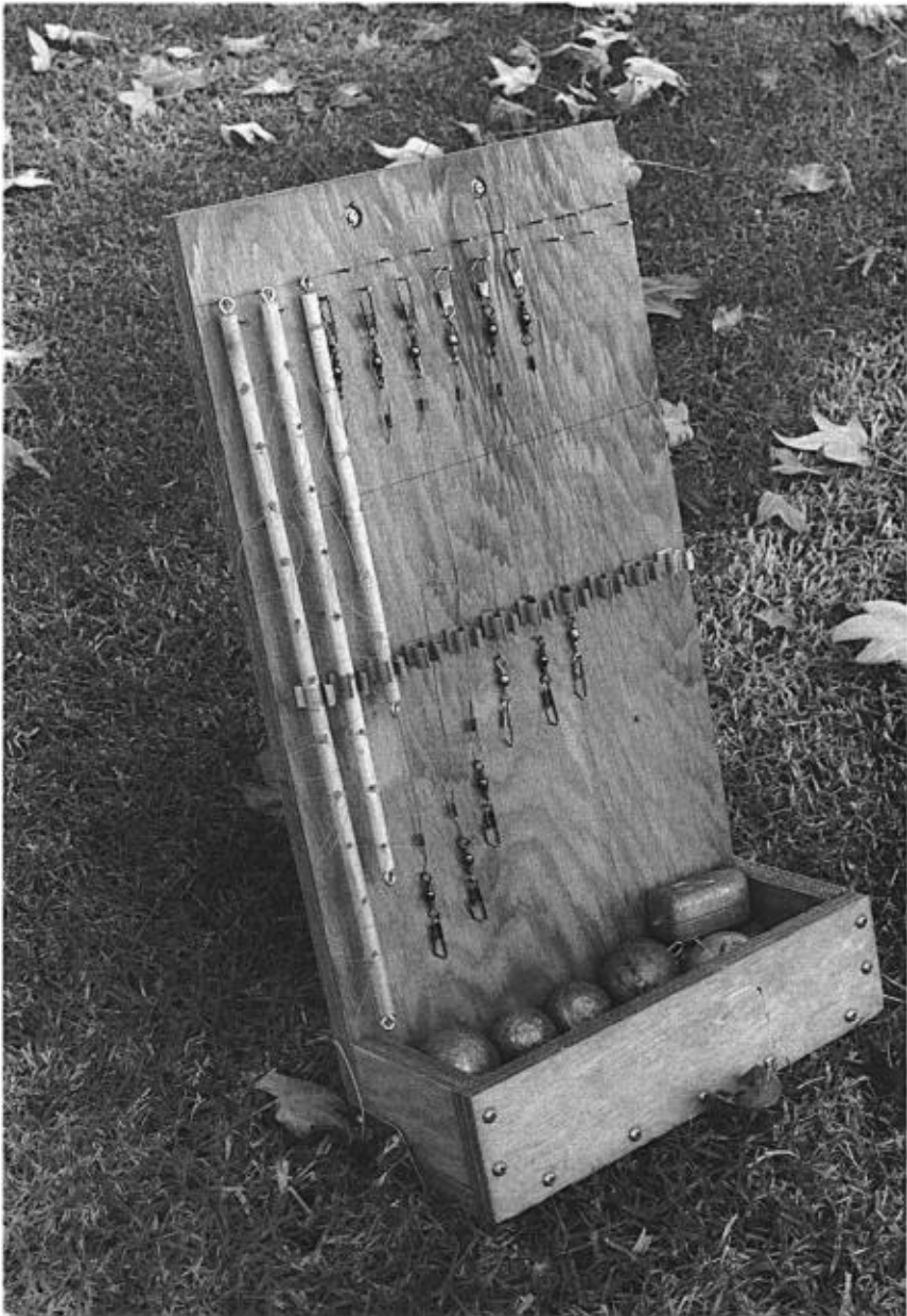
FIGURE 2. Noose rods, leaders with snap swivels, and lead weights stored in the carrying box. Note the different lengths of rods and leaders.