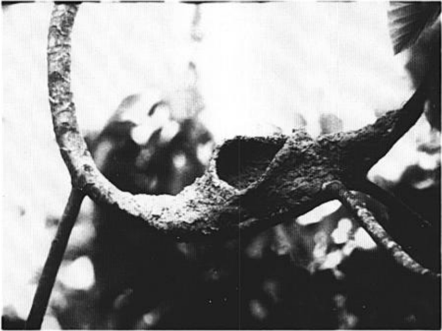
FIGURE 1. Incomplete nest of the Pale-legged Hornero.

secure. The nest measurements: length (without branches)—29 cm, height—21 cm, height of the entrance—9 cm, and width of the entrance—5 cm. The chamber wall was about 13 mm thick. The weight of the dry nest was about 2 kg. The chamber floor was situated slightly higher than the floor of the vestibule, and was lined with some grass-like plants.